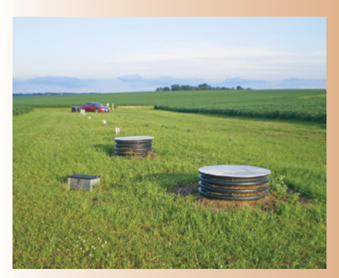
Figure 7. Woodchip bioreactor after installation; circular sumps and PVC wells used for research monitoring (Northeast Iowa Research and Demonstration Farm)