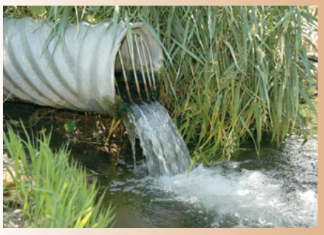
Figure 1. Subsurface tile drain outlet