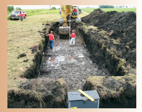
Figure 4. Excavation for a bioreactor installation