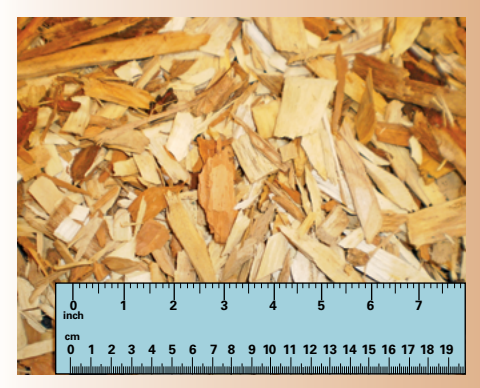
Figure 2. Woodchips commonly used in woodchip bioreactors

IOWA STATE UNIVERSITY Extension and Outreach