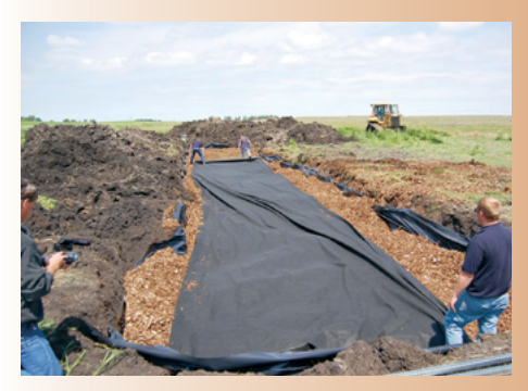
Figure 6. Covering the woodchips with a geotextile fabric before laying the soil cover at a bioreactor installation

Because this is an edge-of-field practice, in-field yields will not be affected. Likewise, bioreactors will have no impact on soil quality. Other practices such as cover crops and adding perennials to a crop rotation can improve water quality while also maintaining or enhancing soil quality. One of the biggest benefits of bioreactors being on the edge of the field is that they are minimally impacted by what is done in the field. This means that other conservation practices such as no-till, cover crops, and improved nutrient management can be done in the field, and the bioreactor will continue to treat the remaining nitrate that is lost in drainage.