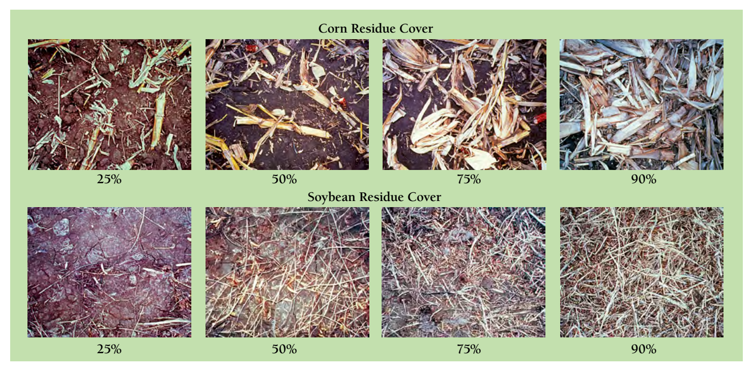
Figure 3. Photographs of corn and soybean residue cover percentages.*

Photos can provide an estimate by comparing field conditions to percentages in photos that show a known percentage of crop residues. To use a photo in the field, look straight down when comparing photos to the soil surface cover. The photo comparison method produces a quick estimate, but is less accurate than other methods.