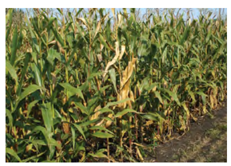
Figure 12: Corn plants prematurely killed by stalk rot.

A farmer must pay more attention to fields throughout the growing season. Observation of diseases will allow a corn grower to make more intelligent management decisions for the next year. Different diseases may require different control measures; a farmer has to know which disease is causing the injury, how widespread and how severe it is. Leaf diseases that appear one year and will likely carry over to the next year and will require management decisions for the next year's crop.