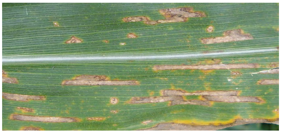
Figure 8: Symptoms of gray leaf spot.

becoming relatively widespread in the western Corn Belt.