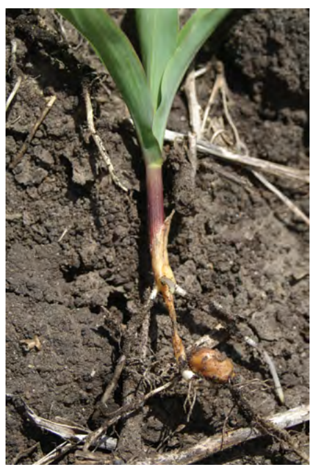
Figure 10: Seedling blight. The mesocotyl is rotted by soil fungi.

Above-ground symptoms of seedling infection are yellow, wilting and death of leaves, and stunting of the top growth. The young roots will be rotted. The mesocotyl (first internode above the seed) also can be rotted, which impedes movement of water and nutrients from the seed and primary roots to the shoot (figure 10). Seed rots and pre-emergence damping off can be a problem when cool soil or saturated soil conditions persist for extended periods of time. Prolonging the time that the young plant is dependent on the seed for food will provide more time for the soilborne pathogens to attack the seed and