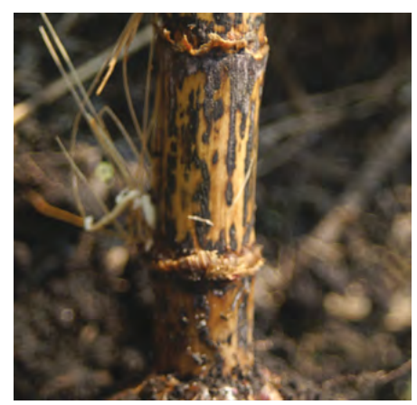
Figure 5: Symptoms of anthracnose on corn stalk.

Leaf symptoms are brown, spindleshaped lesions with yellow to reddishbrown or purple borders (figure 3). Top dieback symptoms (figure 4) are death of the top of the plant. If the leaf sheath is peeled back, black blotches can be seen on the stalk. Stalk rot symptoms are large dark brown to shiny black areas on the outside of the lower internodes (figure 5). Pith tissue becomes disintegrated and infected plants may lodge. Frequently, the stalk