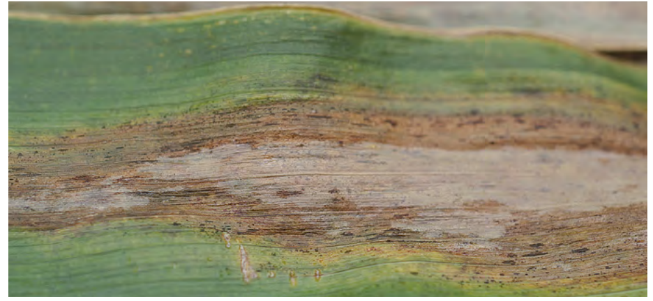
Figure 7: Symptoms of Goss's wilt.

This disease is caused by the bacterium Corynebacterium nebraskense and is