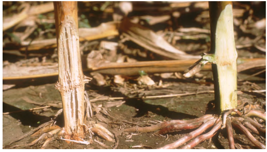
Figure 11: Plant on left is affected by stalk rot; healthy plant is on right.

tillage systems throughout the growing season. The significance of the additional moisture under no-till its ultimate effect on stalk rot.