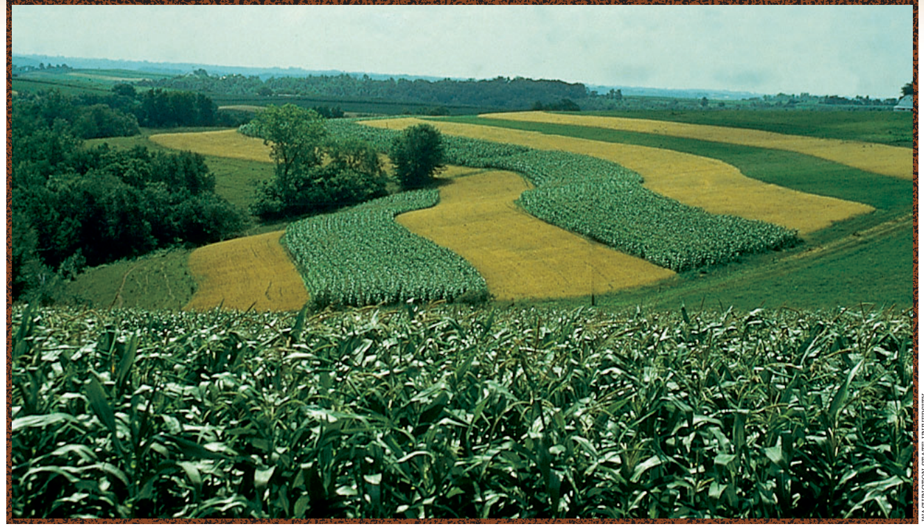
A minimum of three crops in a rotation is usually found on lowa organic farms.