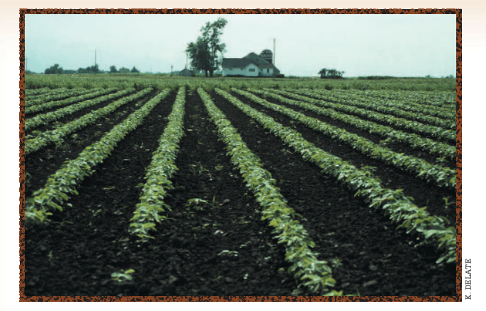
Early weed management is essential in preventing problems later in the season.