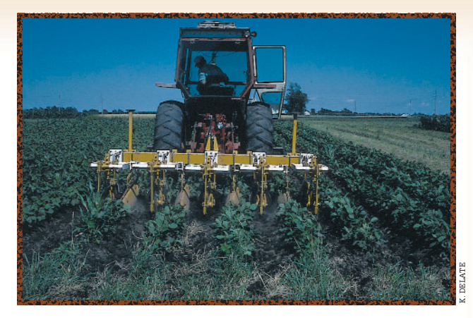
Row cultivators are used two to three times to control weeds between rows.