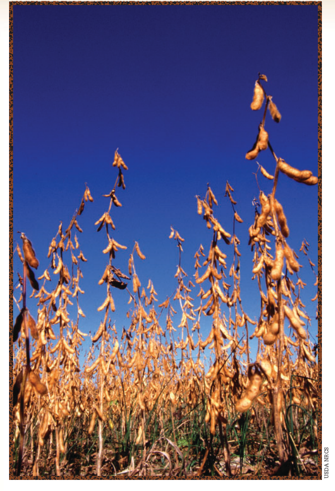
Seeding rates of 175,000 to 225,000 seeds per acre provide quick in-row shading and weed management.