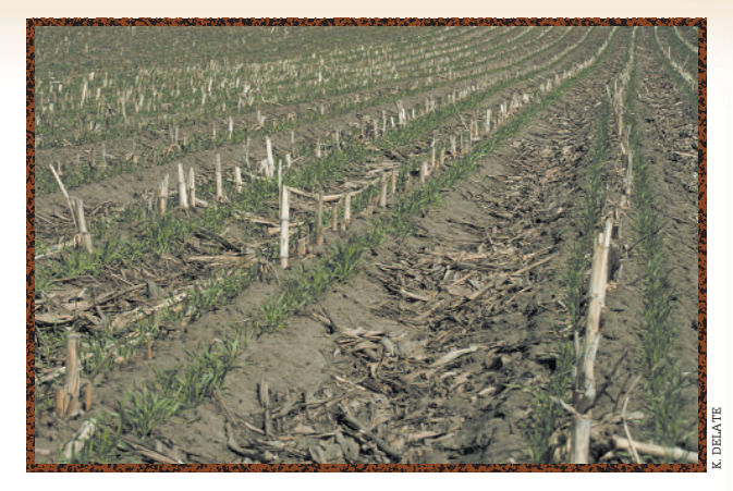
Many organic farmers plant a cover crop of winter rye on ridges or tilled CRP land prior to their soybean crop to assist in erosion and weed prevention.

Conservation Reserve Program (CRP) land must be adequately prepared for organic soybean production. Pasture grasses and legumes in the CRP land must be adequately degraded before planting soybeans. To be sure CRP plants are degraded, organic farmers often moldboard plow in the fall and plant a cover crop of winter rye to help control erosion, aid weed control (the rye deters weed establishment), and provide some organic matter when turned under in the spring.