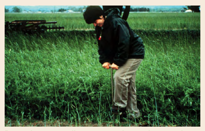
By testing your soil, you can estimate the quantity of nitrogen your cover crop provides (shown: hairy vetch and rye).

Soil quality includes all the physical, biological, and chemical (as in mineral elements, such as nitrogen) components necessary for soil health. Only naturally-occurring materials are allowed in organic production and processing and all applied materials must be recorded in farm records if any produce is sold as "organic."