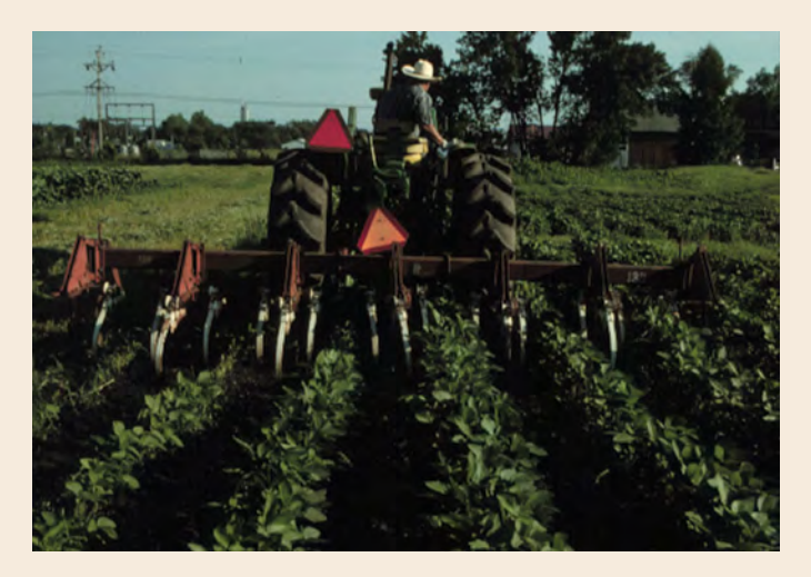
Row cultivators can be used for weed management between rows when crops are small and there is sufficient width between rows.

The roller/crimper crushes a cover crop planted in the previous fall. Seeds can be directly planted or drilled into the flattened mulch.