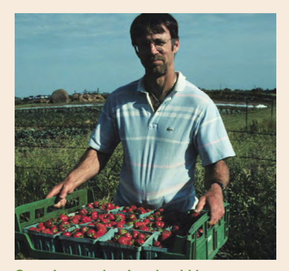
Organic strawberries should be grown on straw-mulched beds to help prevent disease and keep produce clean.

Most of these materials may require multiple applications, and even then, will not result in the "100% knockdown" obtained with synthetic chemicals. Most insecticides are repellent in nature (insects decrease feeding or avoid colonization through chemical or visual cues). Some, such as neem, also are insect growth-limiting, Some insecticides available for organic growers are listed in table 2.