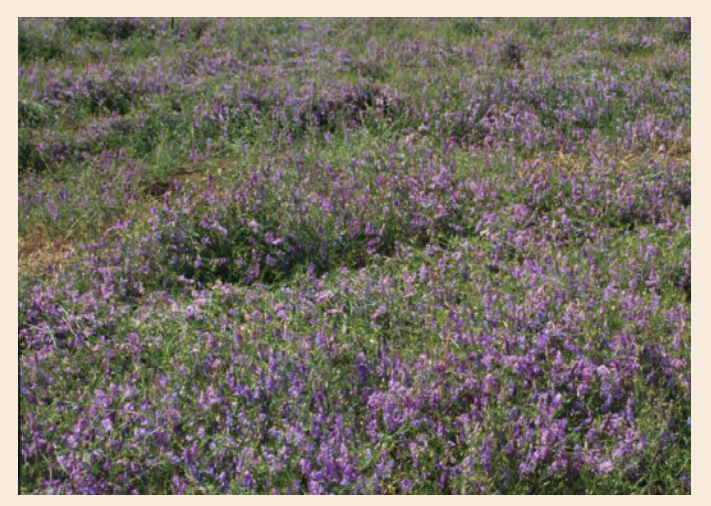
Hairy vetch should be plowed down or rolled when 10 to 20 percent of plants are blooming.

An example of a seven-year rotation in lowa would be a (1) hairy vetch/rye cover crop, (2) tomatoes, (3) onions, (4) salad greens, (5) garlic, (6) Austrian winter pea/triticale cover crop, (7) strawberries. The highest nitrogen-demanding crops are followed by crops with lower demands, followed by nitrogen-supplying crops of legumes and small grains. Plants of the Solonaceae family (tomatoes, potatoes, eggplant, pepper) should be separated by a minimum of three years to avoid nematode or disease problems from previous Solonaceae crops.