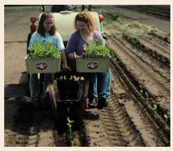
Organic vegetable crops can be planted using mechanical transplanters to aid efficiency.

To sell a product as "organic," the crop must have been raised on land where synthetic chemicals (any synthetic fertilizers, herbicides, insecticides or fungicides) have not been applied for at least three years prior to harvest. In addition, no genetically-modified organisms (GMOs) or GMO crops are allowed in organic production (e.g., Roundup-Ready® soybeans and Bt-sweet corn®). Other practices specifically disallowed for organic production include use of "biosolids" (sewage sludge) due to concerns with bacterial and heavy metal contamination. Irradiated products also are prohibited. Organic producers who gross less than $5,000 per year and wish to sell their produce as "organic" are exempt from certification fees but must follow organic standards and register with the lowa Department of Agriculture and Land Stewardship (see References).