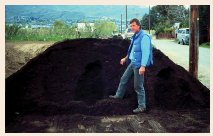
Making or purchasing compost for your soil fertility needs will include assuring that all ingredients meet organic standards (see table 1).

Raw manure can be used from animals that have not been raised organically but all manure must be incorporated in the soil 4 months before harvest or composted (see Composting section on page 4). Composting at the proper oxygen level, temperature, and humidity should break down all synthetic materials in manure, but if you are concerned about the persistence of antibiotics, hormones, or other synthetic substances fed to animals that have not been raised on organic farms, you may wish to use manure only from organic farms or from a certified organic supplier.