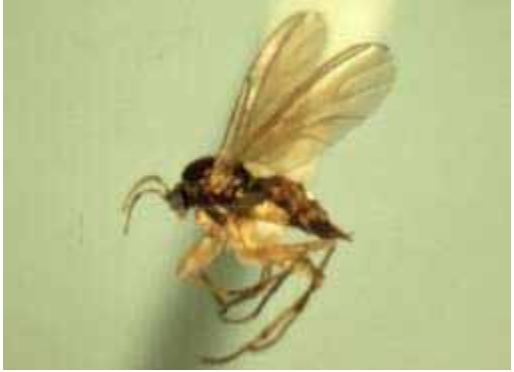
Figure 10: Fungus gnat adult (Dept. of Entomology, Univ. of Minn.)

Control options: Water thoroughly, but let soil dry as much as possible without letting plants wilt, Bacillus thuringiensis H-14.