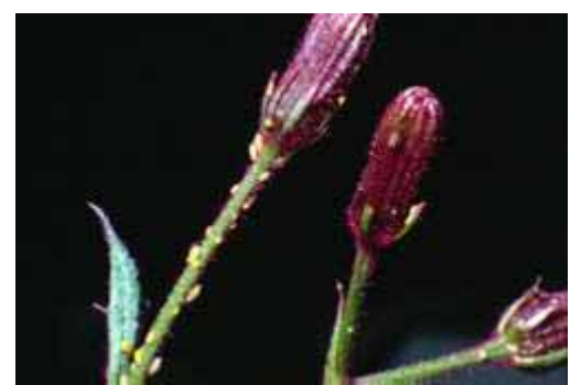
Figure 15: Aphids infesting hibiscus stem (Jeff Hahn)