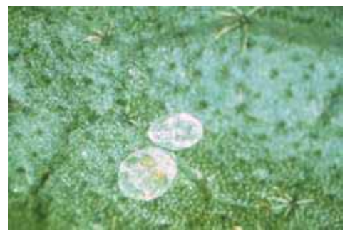
Figure 13: Whitefly nymphs (Phil Pellitteri, Univ. of Wisconsin)