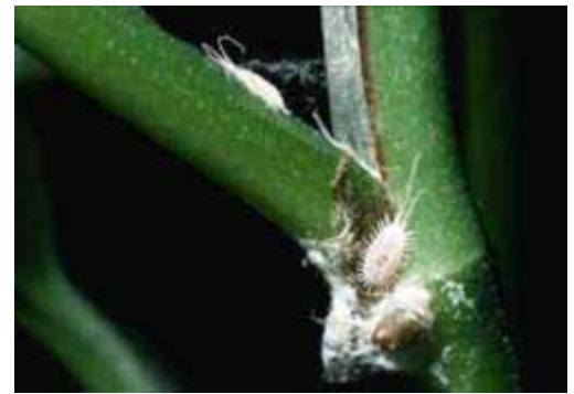
Figure 6: Mealybugs on philodendron stem (Jeff Hahn)

Mealybugs are most common along veins on the undersides of leaves and at axils, where leaves join stems. Some mealybugs may also be found below the soil surface on the main stem. They pierce plant tissue with sharp