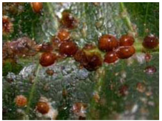
Figure 4: Scale (Phil Pellitteri, Univ. of Wisconsin)

Control options: Washing, physical removal, bifenthrin, permethrin, resmethrin, insecticidal soap,pyrethrins, disulfoton, imidacloprid, plant oil extracts (at least two to three applications sprayed once every 10 - 14 days are usually necessary). Because their waxy covers are so impervious to insecticides, add a few drops of liquid soap or detergent to help the material slide under the edges of the "shells."