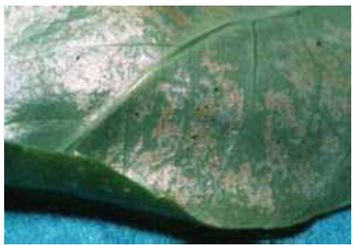
Figure 8: Thrips damage (note black excrement)