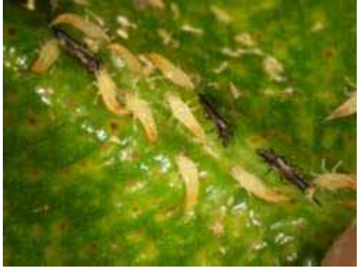
Figure 7: Adult thrips (dark-colored) and immature nymphs (light-colored) (Phil Pellitteri, Univ. of Wisconsin)

Control Options: Washing, bifenthrin, permethrin, resmethrin, pyrethrins, insecticidal soap, neem oil, plant oil extracts (at least two applications sprayed once every 5 days are usually necessary).