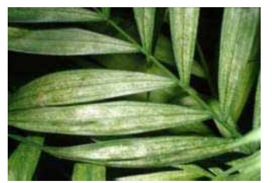
Figure 1: Spider damage on palm

Control options: Washing, bifenthrin, insecticidal soap, plant oil extracts (at least two applications sprayed once every 7 - 10 days are usually necessary).