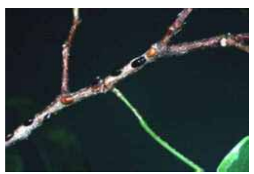
Figure 5: Scale on Ficus (Jeff Hahn)