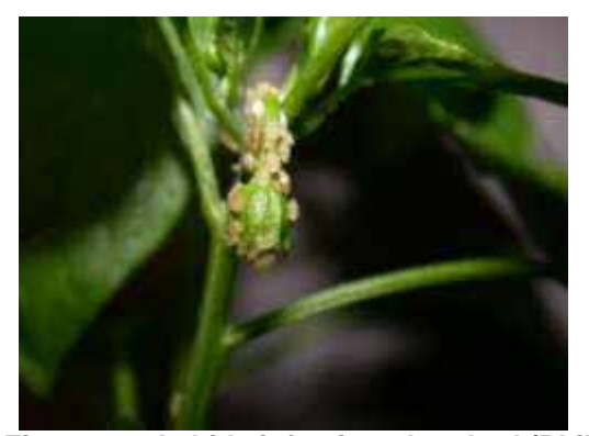
Figure 14: Aphids infesting plant bud

Control options: Washing, bifenthrin, permethrin, resmethrin, insecticidal soap, pyrethrins, neem oil, plant oil extracts, disulfoton, imidacloprid.