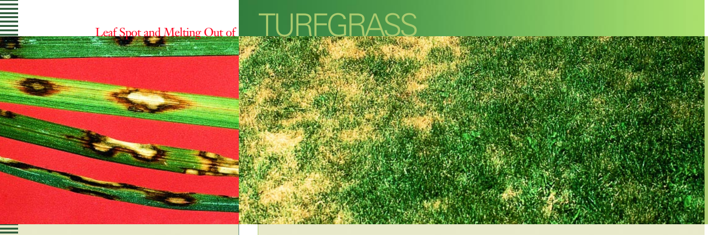
Figure 1 Leaf spots with whitish centers and dark borders.