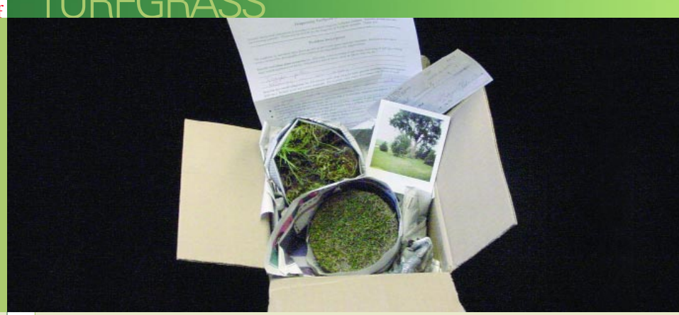
Figure 5 A complete turfgrass sample ready for shipment.