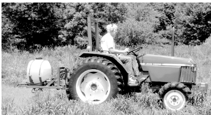
Broadcast sprays are effective over large, weedy areas. Here an area to be planted into native prairie is being sprayed.

Spraying is an important part of riparian buffer maintenance. Tree and shrub seedlings are vulnerable to above and below ground competition during the first 3 to 5 years after establishment. During this time period water, nutrients, and light are crucial for seedling development and survival. Trees and shrubs do not grow as quickly as most weeds and can be shaded out for several years after planting. There also can be a lot of