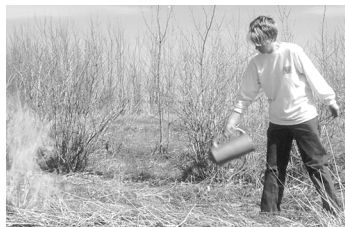
A drop torch is useful in lighting prescribed burns in riparian buffers. A mixture of kerosene and diesel fuel is used in the torch.

Fire is a good maintenance tool for native grass and forb plantings in riparian buffers or filter strips. To reduce weed competition during the year, prescribed burns are usually performed early in the spring. During this time, many of the competing cool-season grasses, weeds, and woody plants begin growing while the native prairie plants are still dormant. Always develop a prescribed burn plan prior to burning. Assistance is available through NRCS and IDNR.