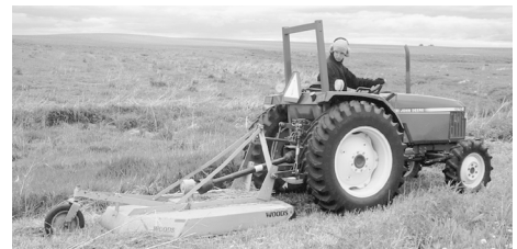
Mowing must be done carefully between tree and shrub rows in a newly established buffer.

A cover of annual grass is considered a good practice for establishing native plants and should be mowed prior to