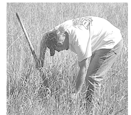
Replanting trees and shrubs is an important part of buffer maintenance.

Replanting and reseeding are important maintenance practices during the first few years following establishment. An annual inspection should be made to identify areas in need of replanting/reseeding. Replanting can be done in the spring or fall. Woody plants should be replanted within a row if more than 3-4 consecutive seedlings have died. Spot planting can be done quickly with just a bucket full of water and seedlings, and a shovel. Replanting in the native grass/forb zone may be a bit more involved depending on the density and quality of grass and establishment. If there is poor establishment, a herbicide like Glyphosate can be used, followed by redrilling. If there is some establishment, but not as dense as desired, the site can be directly redrilled. If the areas needing reseeding are small, hand-spreading the seed and raking it into the ground is acceptable.