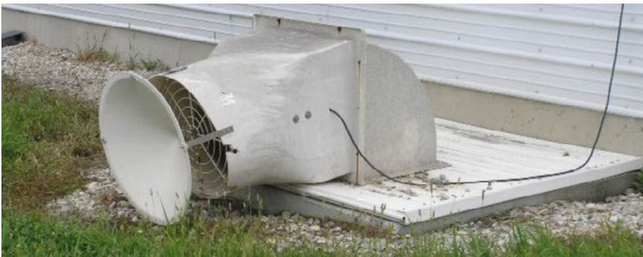
Figure 3. Variable speed fan with wind protector.

When selecting fans for variable speed usage, it is good practice to not expect them to deliver less than half their rated airflow at 0.10 inches of water. For instance, in the 1,000-head example above, 1,500 cfm is needed and a selected fan might be rated at 3,000 cfm. This fan can therefore be used with a variable speed controller to deliver half its rated amount. An additional fan would be required once the pigs grow beyond 75 lbs and require more air.