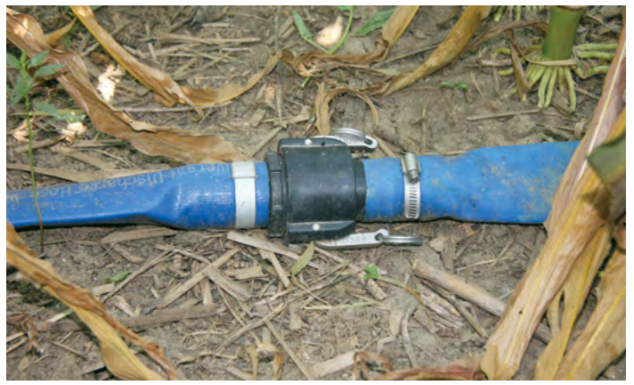
Lay-flat hose with quick coupler

Flood irrigation distribution can be made onto flat to gently sloping (less than 5%) vegetated areas or crop fields. With careful design and management, distribution onto steeper land may also be successful, but care must be taken to avoid runoff and erosion. Controls that allow for repeated small doses of application may be needed if the distribution area is small or steep. Moving the distribution pipe after significant rainfall and pumping events will aid in distributing nutrients and water over a larger infiltration area, gaining additional benefit from the nutrients and reducing the chance of overloading one area to the point of effluent runoff. Additional supply pipe lengths with quick couplers can aid in this process.