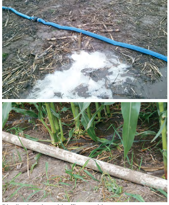
Distribution pipe with effluent exiting

The diameter of distribution and supply pipes depends on the system pumping rate and length of the pipe. For precise design or long pipe lengths, consult pipe friction loss tables and size the pipe so that it doesn't limit pumping capacity. For short lengths (less than 200 feet) and reasonable pressure loss, plastic pipe or hose can carry approximately 2,500 gallons per hour in 2-inch pipe, 5,000 gallons per hour in 3-inch pipe, and 8,000 gallons per hour in 4-inch pipe.