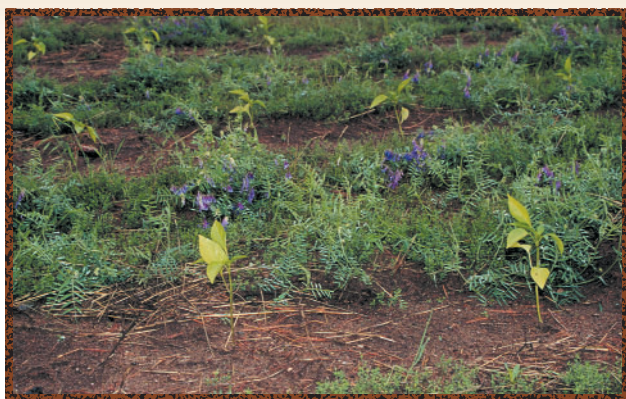
Hairy vetch ( Vicia villosa ) and rye can supply up to 120 lb. of nitrogen per acre to crop fields.

Soil organic matter, created through decomposition and recycling of plant and animal residues, has many important roles in organic systems, including supplying the necessary elements for plant growth.