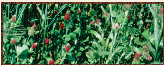
Red or crimson clover, in addition to alfalfa, is used as a legume plowdown on many organic farms. To estimate nitrogen additions from a cover crop, follow the instructions on this page.

If sufficient biomass is produced by cover crops, there may be adequate nitrogen for the subsequent crop. If the cover crop growth is limited by poor weather, however, additional nitrogen, from compost or manure, may be needed. Details on cover crop additions can be found in Managing Cover Crops Profitably (EDC 201), which is available through Iowa State University Extension.)