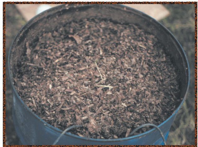
Compost can be made in a 50-gallon barrel, with a front-end loader or with a commercial windrow turner.

which nitrogen-containing materials (e.g., manure, yard waste, or kitchen waste) are mixed with a carbon-containing source (e.g., corn stalks or cobs, straw, and wood chips) to produce a mixture preferably with a carbon-to-nitrogen ratio (C:N) of 30 to 1. The compost mixture must reach and maintain a temperature of \geq 140^\circ\text{F} for at least three days during the composting process in order to limit bacterial contamination. Adequate moisture and temperature are required for proper composting. Most organic farmers utilize front-end loaders or windrow turners to construct outdoor composting systems. Other composting systems include vermi-composting