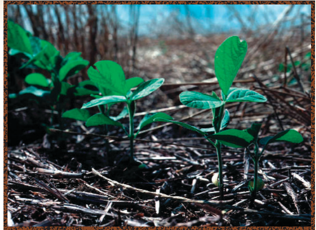
Leaving plant residue from the previous year's crop can increase the level of soil carbon sequestration in organic fields.

Environmental, economic, and food safety concerns are among the many reasons why some farmers choose organic production. Likewise, organic producers differ in the methods they use to achieve the ideal system. Some organic farmers completely shun external inputs, and these farmers enhance the native biological insect control on their farms by conserving beneficial insects' food and nesting sites instead of importing natural pesticides. Compost is created on the farm for their fertilization needs. Other organic farmers do not make a distinction in inputs, and they rely on imported inputs for soil fertility and pest management. This philosophy of "input substitution" is discredited by many long-time advocates of organic agriculture who believe that a truly sustainable method of organic farming would seek to eliminate, as much as possible, reliance on external inputs. Organic certification, however, is based on the use of allowable substances, regardless of their origin.