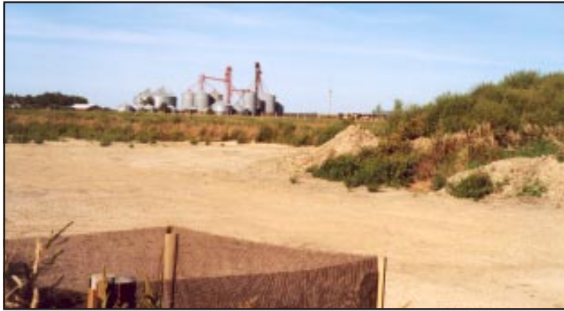
Manure solid settling basin at a feedlot in northwest Iowa.

It is important to note that table values commonly used to prepare manure management plans for a confined beef operation in Iowa use 0.07 lb. P (0.16 lb P_2O_5 ) per day for a finishing animal. In cases where the producer is feeding as close to the animal P requirement as possible, the state forms may be overestimating excreted P, which then has to be managed. However, it is equally important to note that many operations are overfeeding P and other nutrients, including N. Producers should work closely with their feed managers to ensure that this practice is minimized, if not ceased.