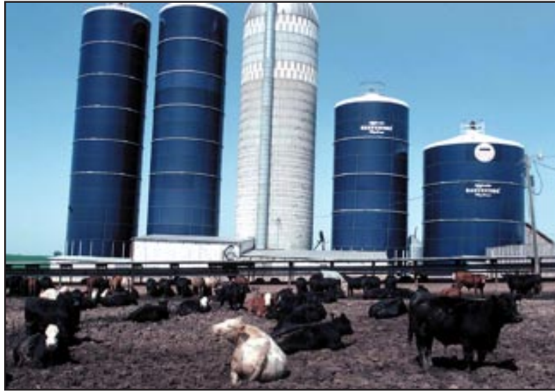
A cattlefeedlot in Iowa.

Iowa is a state with many farmer/feeders. Manure from feedlot cattle is a valuable source of fertilizer nutrients. However, as agriculture, as a whole, continues to move toward becoming a more environmentally aware industry, management of excreted nutrients will receive more attention in feedlot operations. Producers will need to be more aware of nutrient production and nutrient use within their own operation and how best to maintain a balance between the two.