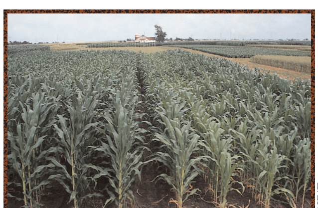
Organic crops are required to be grown in rotations, as demonstrated by the corn-soybean-oat-alfalfa rotation, shown at the ISU Neely-Kinyon Farm.

Maintaining soil fertility through crop rotations, cover crops, intercrops, and biologically-based fertilizers will enhance the competitiveness of the crop plant and inhibit weed growth. Reports indicate that humic and fulvic acids in compost may mitigate weed seed germination. Small-seeded weeds also may be more susceptible to pathogens associated with high organic matter in compost. Compost placed close to the crop plant reduces the amount of nutrients available to weeds between crop rows. Mulch also is effective in suppressing weed establishment.