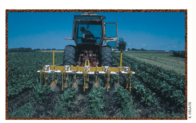
Row cultivators are used two to three times to control weeds between rows.

cultivation occurs when the weeds are at the most vulnerable stage. Fields are rotary hoed at a slow speed (5 mph) three to five days after planting to kill weeds in their initial development or white-thread stage. A harrow also can be used at this stage. One week later, after plants have emerged, fields are hoed again but at a slightly faster speed (7–9 mph). To avoid killing soybean seedlings, it is critical that soybeans are not hoed in the crook stage when the soybean hypocotyl is just at the soil surface. Soybeans also should not be hoed when plants are greater than 8" in height. For vegetable cropping systems, various in-row weeding tool sets, including finger weeders, basket weeders, Bezzerides® torsion weeders, Spyders®, Weed Badgers®, and brush weeders, can be used alone or in combination on a multiple component weeding frame (See Steel in the Field (EDC 125), produced by the USDA