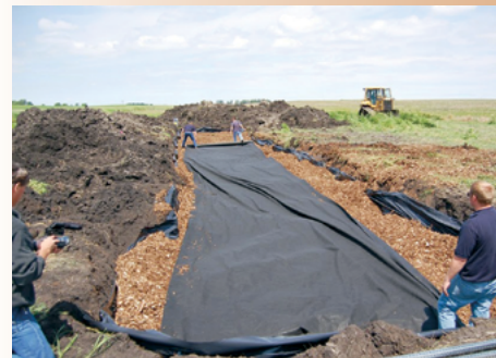
Figure 6. Covering the woodchips with a geotextile fabric before laying the soil cover at a bioreactor installation

A bioreactor's annual nitrate load reduction can range from about 10 percent to greater than 90 percent depending on the bioreactor, the drainage system, and the weather patterns for a given year. Based on research from Iowa, Illinois, and Minnesota, most bioreactors show performance of about 15 to 60 percent nitrate load removed per year. It may be best to target fields or watersheds that have higher nitrate loads in order to have the biggest impact.