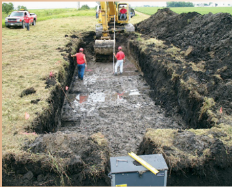
Figure 4. Excavation for a bioreactor installation