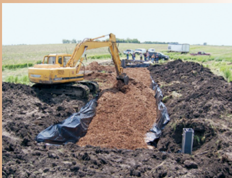
Figure 5. Filling an excavation with woodchips for a bioreactor installation

these denitrifiers an ample supply of carbon to eat and giving them anaerobic conditions in the bioreactor offers them a perfect environment to remove nitrate from drainage.