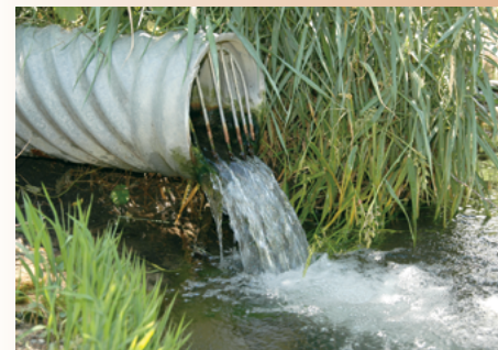
Figure 1. Subsurface tile drain outlet

A woodchip bioreactor is made by routing drainage water through a buried trench filled with woodchips. Woodchip bioreactors also are known as denitrification bioreactors, a name that is slightly more descriptive of the actual process occurring inside the bioreactor. Denitrification is the conversion of nitrate ( \text{NO}_3^- ) to nitrogen gas ( \text{N}_2 ) that is carried out by bacteria living in soils all over the world and also in the bioreactor. These good bacteria, called denitrifiers, use the carbon in the woodchips as their food and use the nitrate as part of their respiration process. Because these bacteria also can breathe oxygen, providing anaerobic conditions through more constantly flowing tile water helps ensure that the bacteria utilize the nitrate. Providing