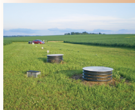
Figure 7. Woodchip bioreactor after installation; circular sumps and PVC wells used for research monitoring (Northeast Iowa Research and Demonstration Farm)