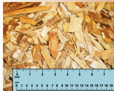
Figure 2. Woodchips commonly used in woodchip bioreactors