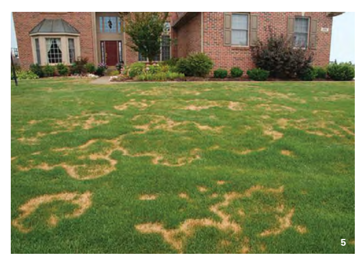
Extensive summer patch damage

Necrotic ring spot causes symptoms in the spring and fall and begin colonizing roots when temperatures are between 50-85°F. Cool, wet weather favors NRS. Drought stress can also predispose attack during the summer. Like summer patch, compaction favors the disease. Dull red tinted to straw-colored tissue in a frogeye pattern is most commonly observed. Small pear-shaped fruiting bodies may be present on the decaying roots. NRS is often most severe on 4-5 year old turf established by seed.