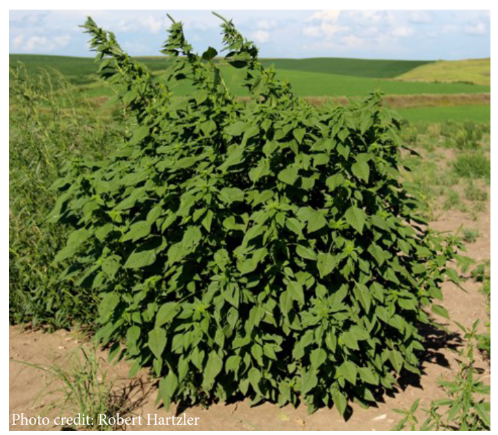
Dense canopy of Palmer amaranth. The ends of stems often have a rosette appearance due to tightly clustered leaves.