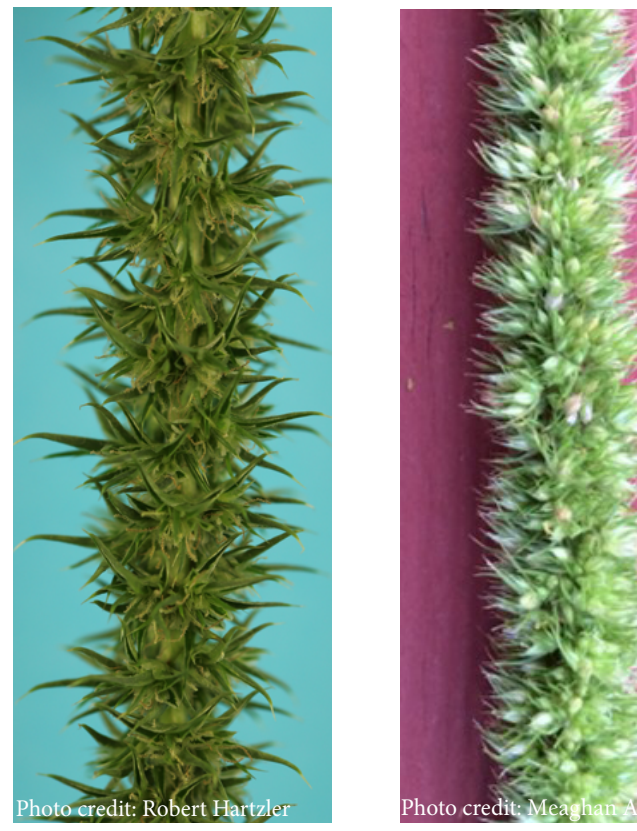
Palmer amaranth inflorescences: female (L); male (R). The large, sharp bracts on female plants are the definitive trait to tell Palmer amaranth apart from waterhemp.

Palmer amaranth is a serious concern due to its fast growth, high competitiveness, prolific seed production, and resistance to multiple herbicides. Currently, Palmer amaranth has a very limited distribution across Iowa. Seed production within fields planted to conservation plantings may provide this weed an opportunity to move into Iowa crop fields.