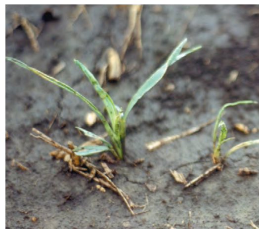
Seed-placed urea stand loss and biuret damage