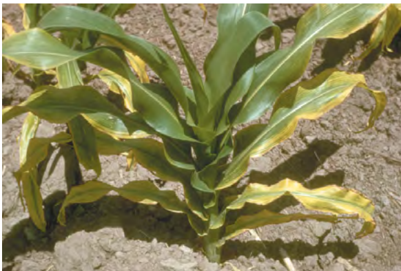
Potassium deficiency in corn, lower leaves

Nutrient deficiency symptoms occur as yellowing of leaves, interveinal yellowing of leaves, shortened internodes, or abnormal coloration such as red, purple, or bronze leaves. These symptoms appear on different plant parts as a result of nutrient mobility in the plant.