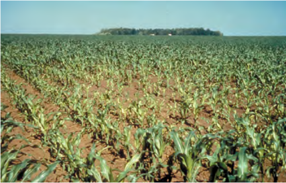
Zinc deficiency in corn

Diagnosing nutrient deficiency symptoms is most reliable when all factors other than the nutrient in question favor normal growth and when the symptoms occur on several plants in an area following a specific soil or management pattern. Comparison of plants in affected and non-affected field areas, as well as other information like soil tests and cultural practices, can help determine specific causative factors.