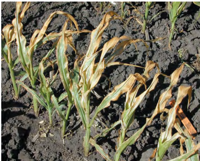
Broadcast solution nitrogen