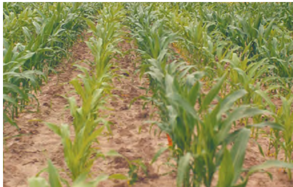
Nitrogen skip pattern in corn