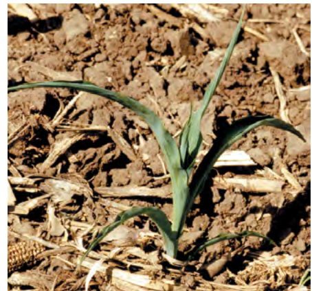
Anhydrous Ammonia Injury