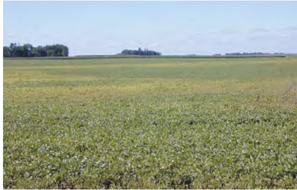
Iron deficiency in soybean