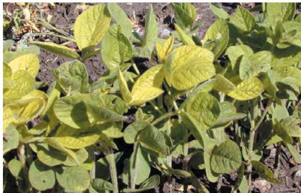
Iron deficiency in soybean, upper leaves