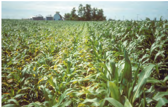
Potassium deficiency, not chiseled (left), chiseled (right)

Nutrient deficiency symptoms that occur in irregular patterns in a field are probably due to a soil condition.