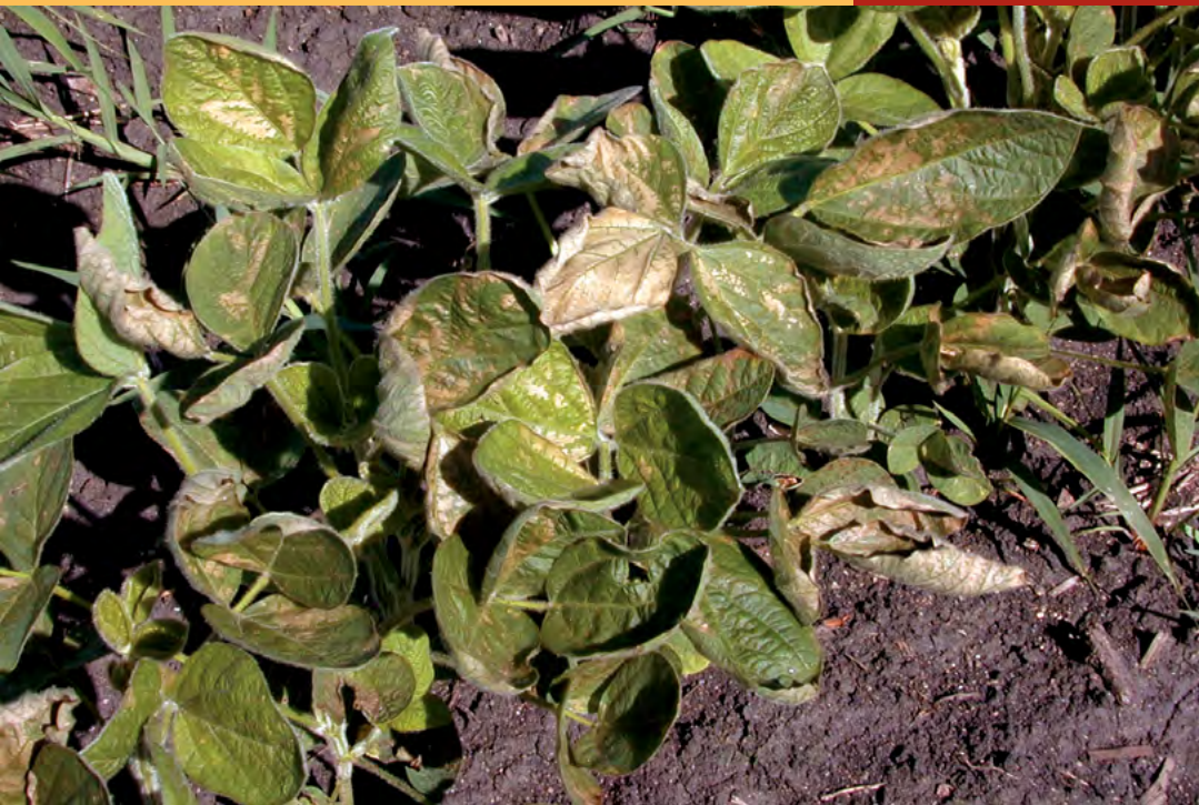
Broadcast nitrogen solution