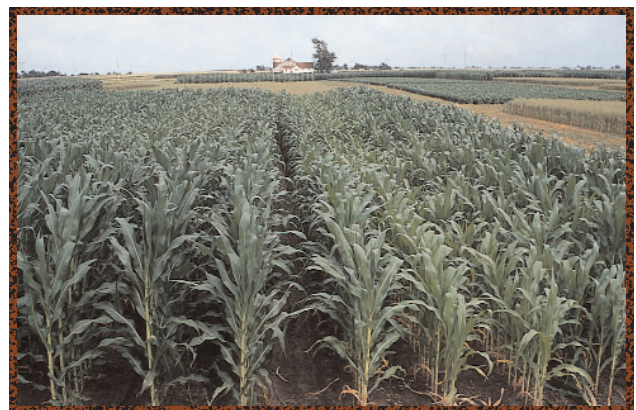
Organic crops are required to be grown in rotations, as demonstrated by the corn-soybean-oat-alfalfa rotation, shown at the ISU Neely-Kinyon Farm.

Maintaining soil fertility through crop rotations, cover crops, intercrops, and biologically-based fertilizers will enhance the competitiveness of the crop plant and inhibit weed growth. Reports indicate that humic and fulvic acids in compost may mitigate weed seed germination. Small-seeded weeds also may be more susceptible to pathogens associated with high organic matter in compost. Compost placed close to the crop plant reduces the amount of nutrients available to weeds between crop rows. Mulch also is effective in suppressing weed establishment.