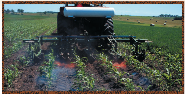
Propane flame burners can be used on organic farms to control weeds between and within rows.

Many organic farmers have included propane (LP) flame-burners as an additional tool in their weed management toolbox.