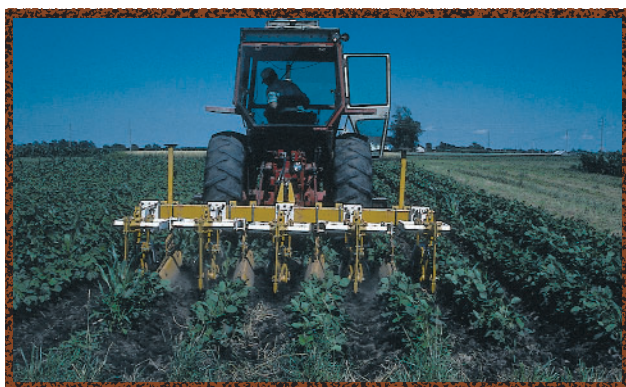
Row cultivators are used two to three times to control weeds between rows.

cultivation occurs when the weeds are at the most vulnerable stage. Fields are rotary hoed at a slow speed (5 mph) three to five days after planting to kill weeds in their initial development or white-thread stage. A harrow also can be used at this stage. One week later, after plants have emerged, fields are hoed again but at a slightly faster speed (7–9 mph). To avoid killing soybean seedlings, it is critical that soybeans are not hoed in the crook stage when the soybean hypocotyl is just at the soil surface. Soybeans also should not be hoed when plants are greater than 8" in height. For vegetable cropping systems, various in-row weeding tool sets, including finger weeders, basket weeders, Bezzerides® torsion weeders, Spyders®, Weed Badgers®, and brush weeders, can be used alone or in combination on a multiple component weeding frame (See Steel in the Field (EDC 125), produced by the USDA