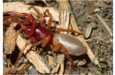
Figure 4. Sowbug spider

Sowbug spider , also known as the woodlouse hunter or the dysderid spider, is an introduced species that is now common and widely distributed in the United States (Figure 4). This medium-sized spider has distinctive coloration: the cephalothorax is purplish-brown, the abdomen is grayish-white, and the legs are orange. Unlike the majority of spiders, the dysderid spider has only 6 eyes. The chelicerae (fangs) are quite large and project forward. Dysderid spiders wander at night in search of food and are ground-dwellers commonly found under rocks and debris. As the name implies, their preferred prey are sowbugs and pillbugs, though a variety of prey may be taken.