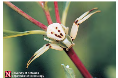
Figure 7. Crab spider

Crab spiders (Figure 7) are small to medium-sized spiders (⅓- to ⅔-inch long) ranging in color from yellow or red to brown or gray. The first four legs are longer than the back four and are held out to the sides giving a crab-like appearance. They can walk forward, sideways, or backward. Crab spiders are passive hunters — they wait motionless and ambush insects that pass by closely. Outdoors, crab spiders are often found on flowers but are also seen on stems or leaves. They are rarely found indoors.