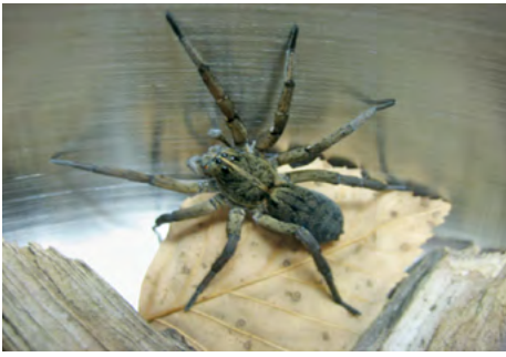
Figure 1. Wolf spider