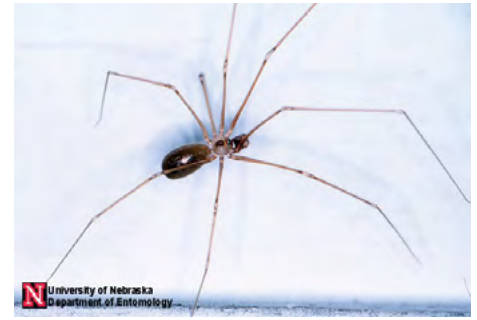
Figure 10. Cellar spider

WEB-BUILDING SPIDERS survive and reproduce well indoors and outdoors, depending on species.