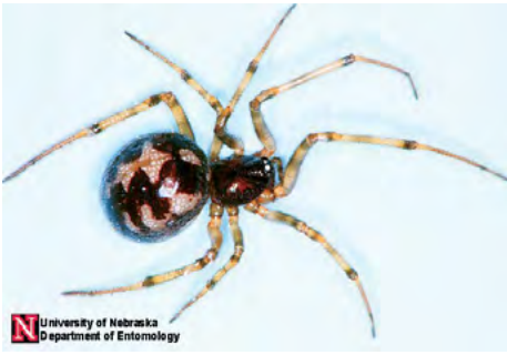
Figure 8. Cobweb spider