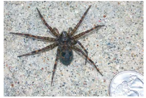
Figure 3. Fishing spider

spread out, some fishing spiders cover as much as 4 inches. They are generally dark-colored, usually brownish or grayish, with white markings. Fishing spiders can “skate” across water and can dive underneath to capture prey. In addition to insects, fishing spiders also can catch tadpoles, small fish, and other small vertebrate animals.