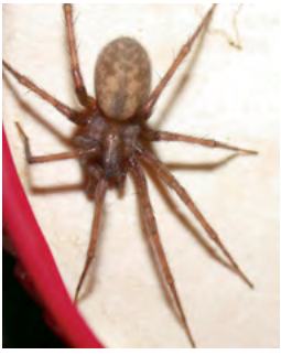
Figure 14. Barn funnel weaver