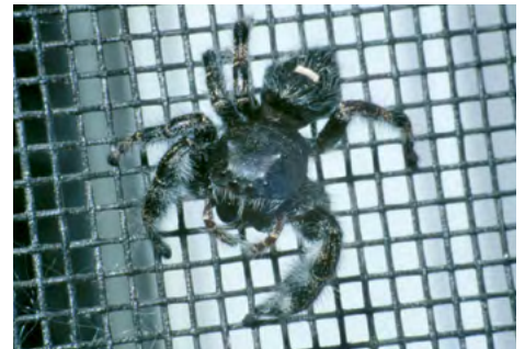
Figure 5. Jumping spider

Jumping spiders (Figure 5) are compact, medium-sized spiders that get their name from their ability to leap on their prey, often jumping many times their own body length. They are active during the day and are often found on windows, ceilings, walls, and other areas exposed to sunlight. Jumping spiders are compact, small to medium-sized (about ¼- to ½-inch long) and dark-colored with white markings. Some can be brightly colored, including some with iridescent mouthparts. These spiders move quickly in a jerky, irregular gait and can run sideways and backward. The two middle eyes of jumping spiders are particularly large and jumping spiders have the best vision of spiders, seeing objects up to eight inches away.