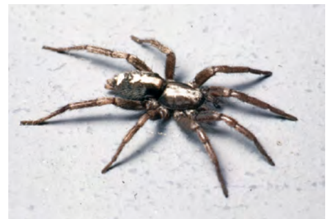
Figure 6. Parson spider

Parson spider (Figure 6), one of the gnaphosid spiders, is a medium-sized spider (½-inch long) with a brownish body and gray abdomen with a white band running down over half the length of its abdomen. Parson spiders actively hunt at night and chase their prey. During the day, they are usually found outdoors under stones or loose bark in silken retreats. Indoors, they hide under objects or in cracks or crevices.