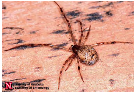
Figure 9. American house spider