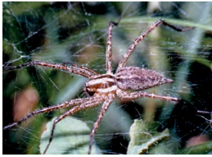
Figure 15. Grass spider