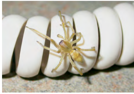
Figure 2. Sac spider