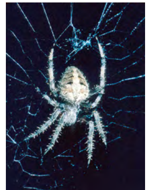
Figure 12. Barn spider