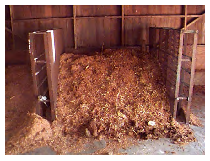
Figure 2. This low-cost bin composting system was constructed with used materials and is located inside a converted farm building.

Alternative cover materials that are much easier to obtain include chopped cornstalks or straw. Since these tend to be less absorptive and have poorer insulating properties than sawdust, their use requires more care during cold or wet weather. Poultry litter, a mixture of sawdust and poultry manure produced during turkey and broiler production, has been used successfully for carcass composting in the poultry industry. Not only does litter have the desirable characteristics of sawdust, the bacteria and nitrogen added by the manure make this mixture more biologically active than sawdust alone. Bedding from swine hoop buildings also can be used as cover material. Since the quality of used bedding from hoop buildings varies considerably, care should be taken to avoid materials that are saturated with liquid or that contain high proportions of manure because these conditions can lead to slow decay and/or excessive odor production.