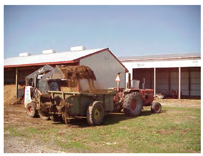
Figure 1. Composting rapidly decomposes swine mortalities, producing a soil-like product that can be spread on cropland.

IOWA STATE UNIVERSITY Extension and Outreach