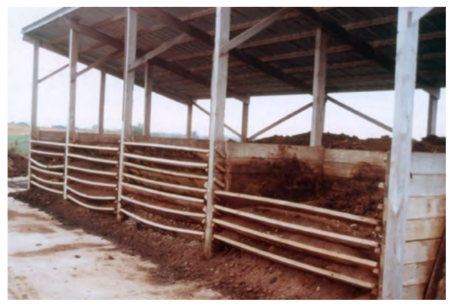
Figure 5. This simple four-bin swine mortality composting unity includes space for dry storage of cover material behind the bins.