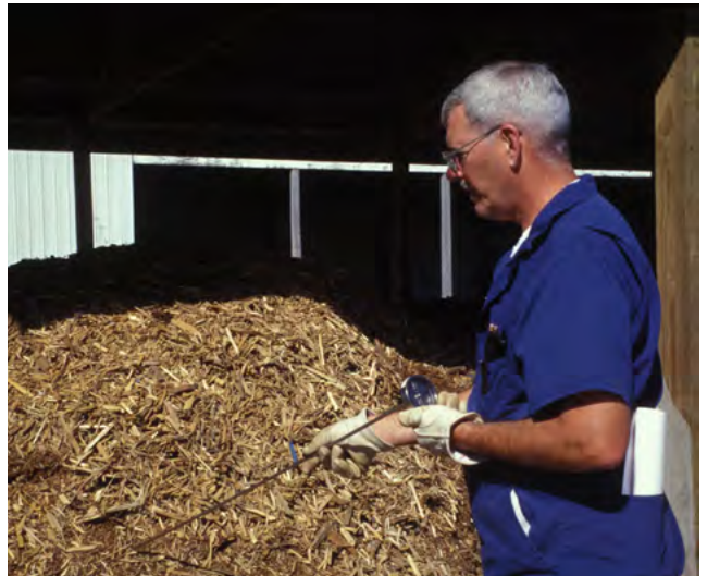
Figure 4. Checking internal temperatures with a composting thermometer is a quick way to determine if moisture and other conditions are suitable for rapid decay and pathogen reduction.

Bin-type composting systems located under a roof are recommended for best year-round performance, optimal processing, and minimal problems with runoff and scavengers. Total bin volume for a swine mortality composting operation is based on average daily weight of animals to be composted. Typically, about 20 cubic feet of primary bin volume is recommended for each pound of average daily loss, with an equal amount of secondary bin space.