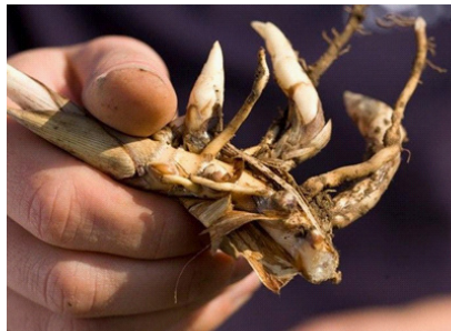
Giant Miscanthus rhizome.

As with other vegetatively propagated crops, adequate soil moisture at planting greatly favors establishment success. Establishment success may be limited by death of plants in the first winter after planting.