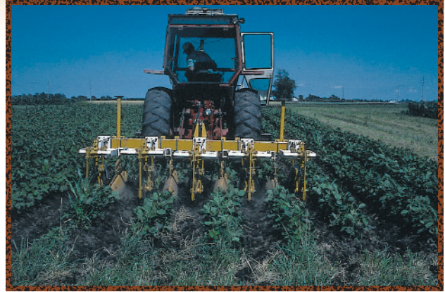
Row cultivators are used two to three times to control weeds between rows.