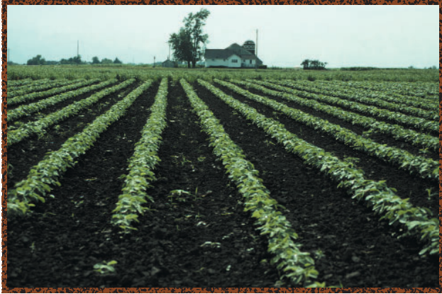
Early weed management is essential in preventing problems later in the season.