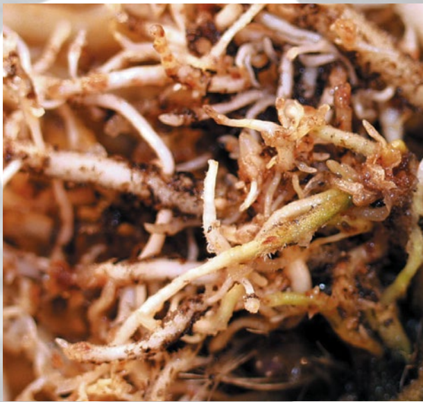
Figure 27. Root knot nematode damage to roots.