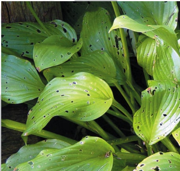
Figure 28. Slug feeding damage.