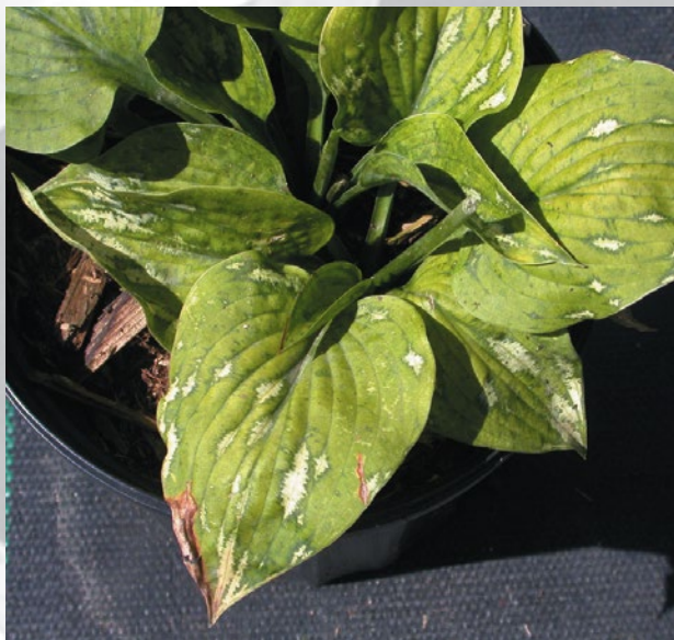
Figure 16. Symptoms caused by HVX.