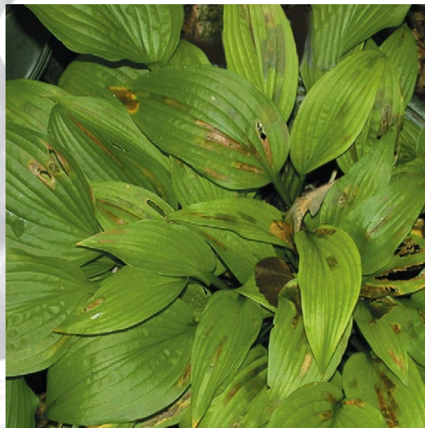
Figure 24. Foliar nematode damage.

Remove all leaves as close to the crown as possible, and forcefully wash off soil from the roots using a strong stream of water. Dip the crown and roots in hot water (~123° F) for approximately 4-8 minutes, followed by a dip in cold water. Carefully monitor the water temperature to avoid damaging the plants. Pot or plant the heat-treated plants immediately after the cold water dip. Plants adjacent to infested plants also should be heat-treated. Because foliar nematodes can survive in the soil for a period of time, replanting in another location is recommended. Currently there are no nematicides or insecticides labeled for outdoor use to control foliar nematodes on ornamentals.