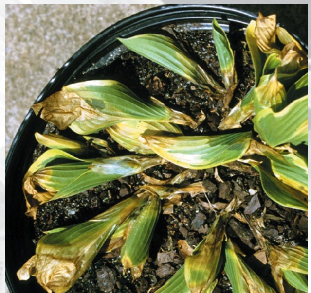
Figure 14. Bacterial soft rot—advanced symptoms.