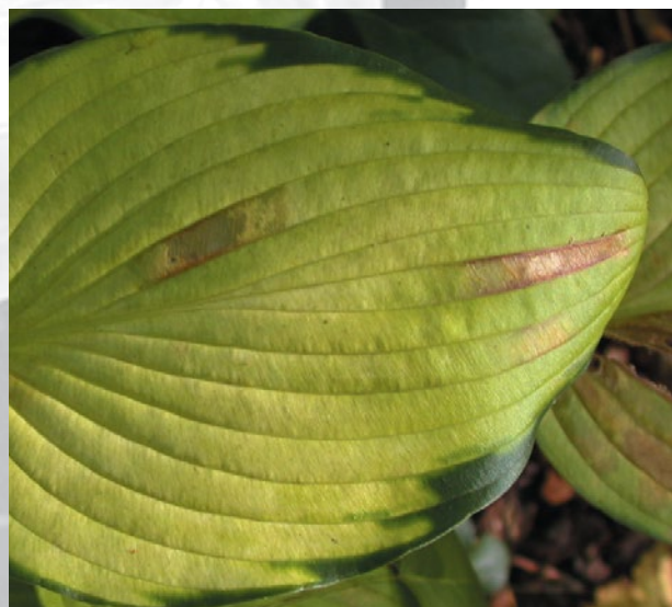
Figure 25. Initial symptoms from foliar nematodes.