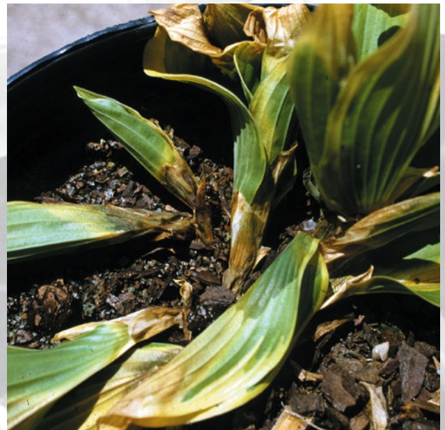
Figure 13. Bacterial soft rot—leaves collapse.