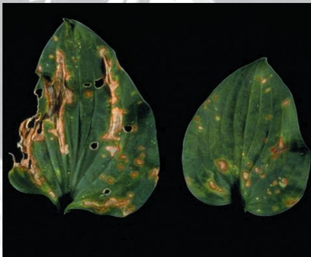
Figure 22. Symptoms caused by tobacco rattle virus.