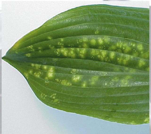
Figure 19. Symptoms caused by ToRSV.