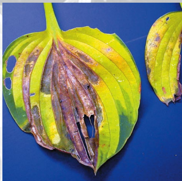
Figure 26. Advanced symptoms of foliar nematode damage.