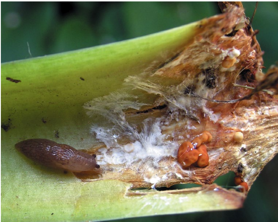
Two major pests on hosta—slugs and petiole rot.