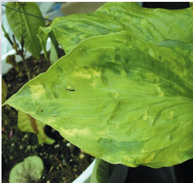
Figure 21. Symptoms caused by tobacco rattle virus.