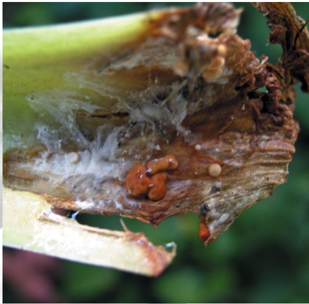
Figure 4. Sclerotia and mycelium of Sclerotium rolfsii var. delphinii .