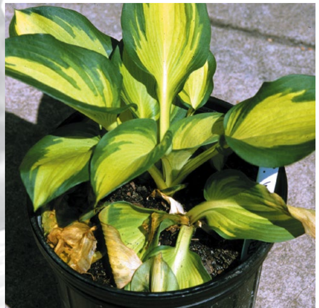
Figure 12. Bacterial soft rot—initial symptoms.

Bacterial soft rot of hosta can be caused by several species of Erwinia , including Erwinia carotovora subsp. carotovora , E. carotovora subsp. atroseptica , and E. chrysanthemi . Bacterial soft rot occurs in both gardens and nurseries, particularly following very cold winters where plants may have been damaged by ice or freezing temperatures. In areas with mild winters, hosta plants sometimes are refrigerated to satisfy cold dormancy requirements. In the Southeast U.S., refrigerated storage results in increased plant size and earlier, more uniform crop emergence than overwintering the crowns outdoors. Refrigeration typically lasts for 4 weeks at 39°F. However, dropping the temperatures within the refrigerated coolers to 32°F for 24 hours can increase the development of bacterial soft rot. Soft rot bacteria enter plant tissue primarily through