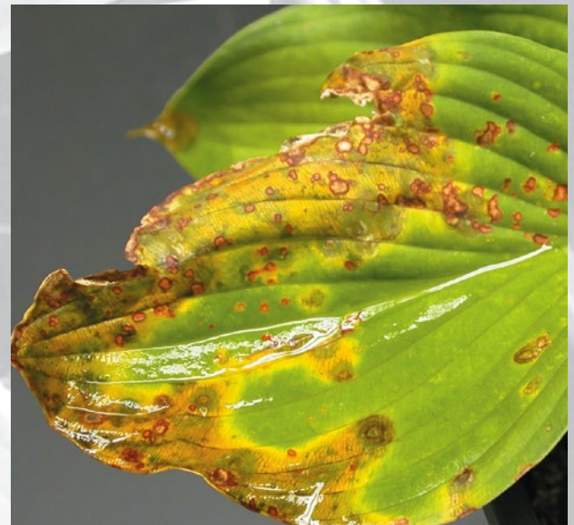
Figure 2. Lesions caused by anthracnose fungi.