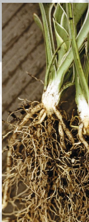
Figure 10. Healthy roots and crown.