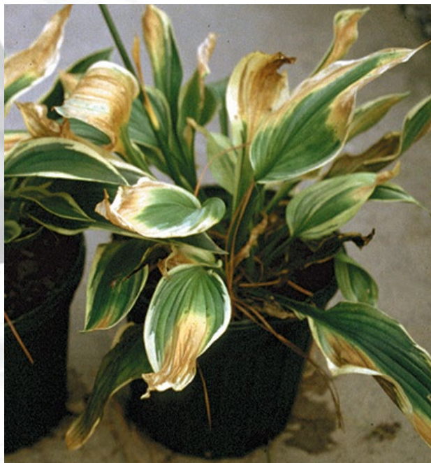
Figure 9. Above-ground symptoms of Fusarium root and crown rot.