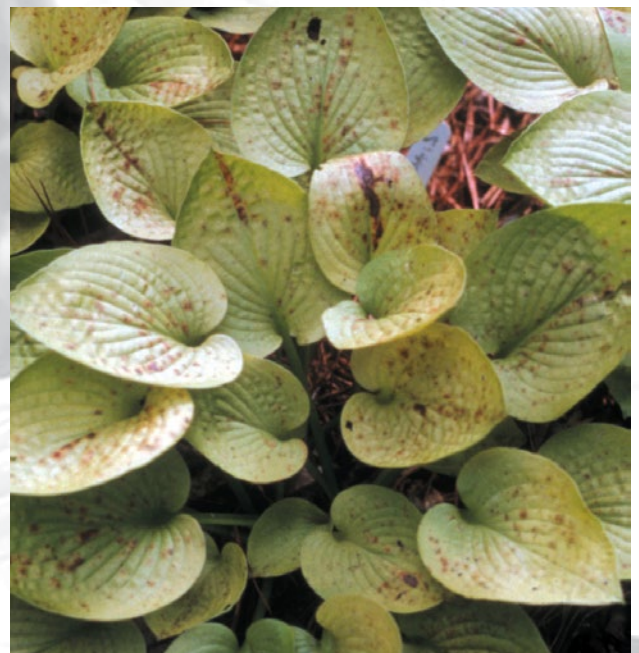
Figure 1. Anthracnose harms the appearance of leaves.

Other foliage diseases are caused by species of Cercospora , Alternaria , and Phyllosticta fungi. These fungi cause leaf spots that often are distributed randomly across the leaf during warm, rainy weather. Cercospora leaf spot (Fig. 3) is very common in the southeastern U.S. Leaf spots are tan to reddish with a darker rust-colored border and develop primarily in mid- to late-summer. Leaf spots reduce aesthetic value but seldom kill plants.