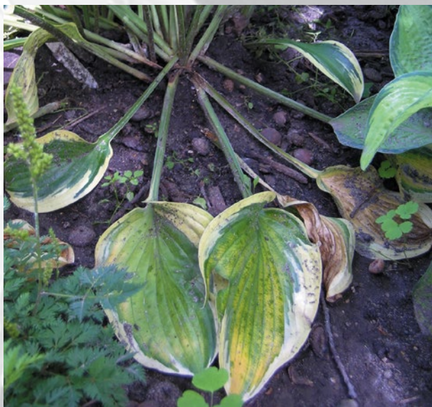
Figure 6. Leaves collapsing from petiole rot.

Practices that reduce the amount of time leaves remain wet can help suppress disease development and pathogen spread. Foliage applications of fungicides such as azoxystrobin, chlorothalonil, copper hydroxide, or myclobutanil also help reduce leaf spots and should be applied when leaf spot symptoms are first seen. Removal of diseased leaves and leaf debris can help reduce disease in subsequent crops.