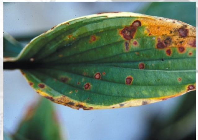
Figure 3. Lesions caused by Cercospora fungi.