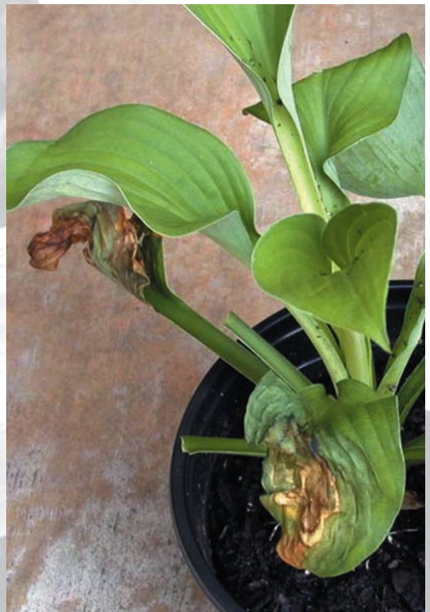
Figure 7. Phytophthora foliage blight.

Root and crown rot. Plants grow slowly and are stunted compared to healthy plants of the same age, and foliage becomes chlorotic and may wilt. Affected plants eventually die. Below ground, root hairs are lacking, root systems overall are smaller than normal, and diseased roots are discolored (various shades of brown to black) and necrotic. If the infection moves into the crown, a brown, moist decay will be evident when the crown is split.