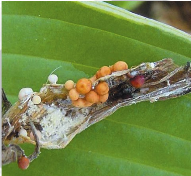
Figure 5. Sclerotia and mycelium at base of petiole.