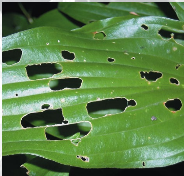
Figure 29. Slug feeding damage.