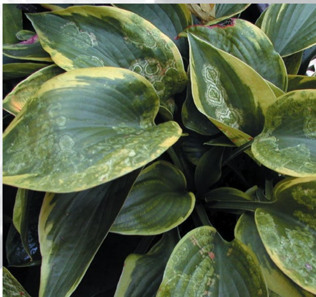
Figure 17. Symptoms caused by INSV.

wounds caused by freeze damage or during the propagation process. However, they also may enter through natural openings such as stomata. Dividing plants can spread the bacterium into the freshly made wound and cause bacterial soft rot. Warm temperatures (80 to 86°F), high relative humidity, and poorly draining soils are additional conditions favorable to bacterial soft rot development. The bacteria can survive in infected tissues, on contaminated tools, and occasionally in soil. Erwinia spp. also have been recovered from nursery irrigation ponds and run-off water. Irrigation with Erwinia -contaminated water can introduce the bacterium into production areas. The bacterium also can survive along the veins and petioles of hosta leaves without causing disease. Once the bacteria enter the plants, disease symptoms develop under favorable environmental conditions.