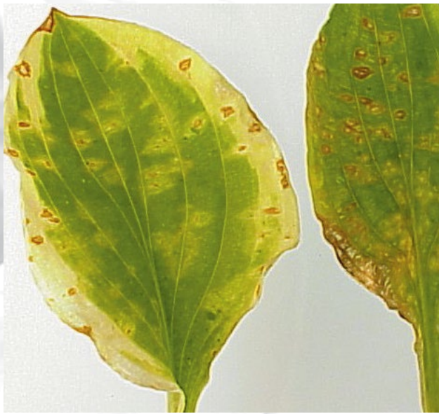
Figure 15. Symptoms caused by HVX.