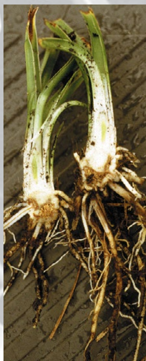
Figure 11. Roots and crowns infected with Fusarium spp.