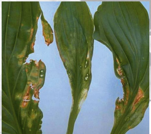
Figure 20. Symptoms caused by ToRSV.