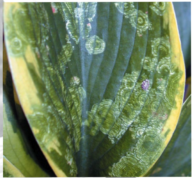
Figure 18. Symptoms caused by INSV.

Tomato ringspot virus (ToRSV) produces chlorotic spots of various shapes and sizes on hosta leaves; spots have indefinite margins that fade from yellow to green (Fig. 19, 20). In addition to vegetative propagation, ToRSV is transmitted by root-feeding nematodes and possibly by pollen.