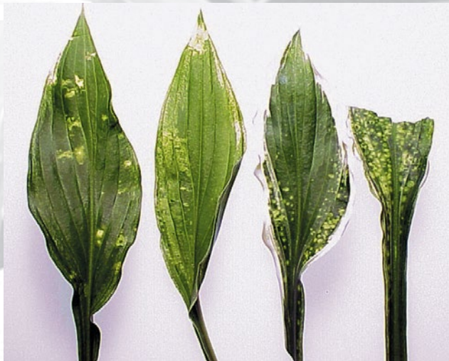
Figure 23. Symptoms caused by ArMV.

Tobacco rattle virus (TRV) produces mottling, chlorosis, necrosis, and ringspots (Figs. 21, 22). TRV is spread by a nematode and has a very wide host range.