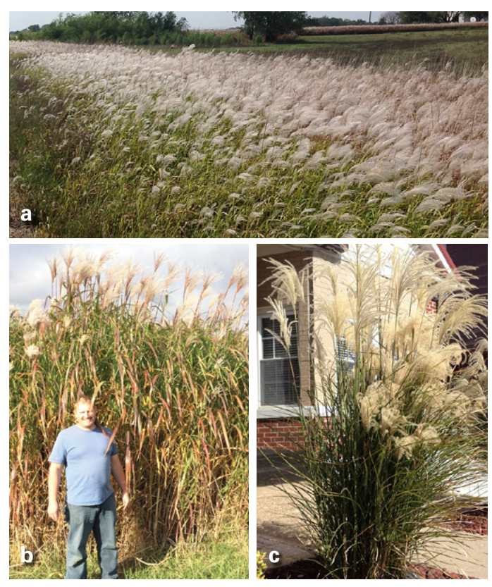
Figure 1. (a) M. sacchariflorus, (b) M. x giganteus, (c) M. sinensis

Miscanthus x giganteus is sterile and unable to produce viable seeds. Its rhizomes do not spread quickly. Because of these traits, the invasive risk of M. x giganteus is negligible. In contrast, M. sinesis plants can produce thousands of seeds, while M. sacchariflorus rhizomes can spread rapidly. These two Miscanthus species are of invasive concern in Iowa.