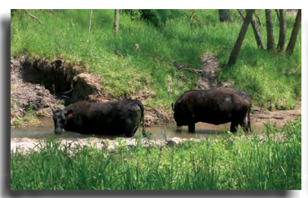
Figure 1. Cattle will often congregate near pasture streams to quench their thirst and to regulate body temperature.

Cattle often will congregate near pasture streams to quench their thirst and regulate their body temperature ( Figures 1-2 ). This may result in an uneven cattle distribution within the pasture and could increase sediment, nutrient and pathogen loads in surface waters. Cattle and pasture utilization can be influenced by the presence of off-stream water, nutrient supplementation sites, the pasture's topography, weather and shade distribution within the pasture. By providing off-stream water, nutrient supplementation sites and shade away from pasture streams, cattle can be encouraged to utilize the pasture more uniformly, resulting in less time in or near pasture streams and improved forage utilization.