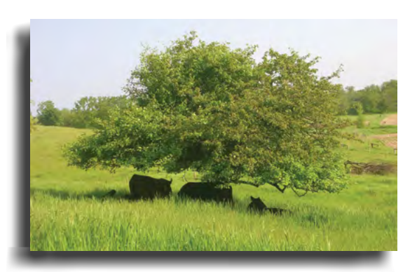
Figure 4. The presence of shade in the pasture's uplands can decrease the amount of time cattle spend in or near pasture streams.

The presence of shade – from natural or artificial sources – in upland portions of pastures has decreased the amount of time cattle spend in or near pasture water ( Figures 4-5 ).