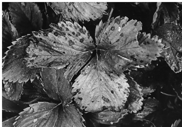
Figure 6. Early leaf scorch symptoms.

Because the powdery mildew fungus apparently survives the winter on living leaves, removing leaves that appear infected before flowering begins may help reduce disease severity. Many widely available commercial cultivars are highly resistant to powdery mildew. Applying fungicides at regular intervals from the early flower period through the growing season also can control the disease and limits its carryover from one growing season to the next. However, use of fungicides to control powdery mildew on the foliage has not significantly increased yields, even for highly susceptible cultivars.