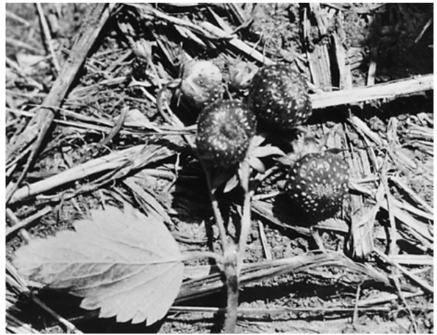
Figure 9. Button berries that result from the feeding of the tarnished plant bug.

Several types of diseases can cause strawberry fruit rots. Information on the most common fruit rot diseases is in table 1 on page 9.