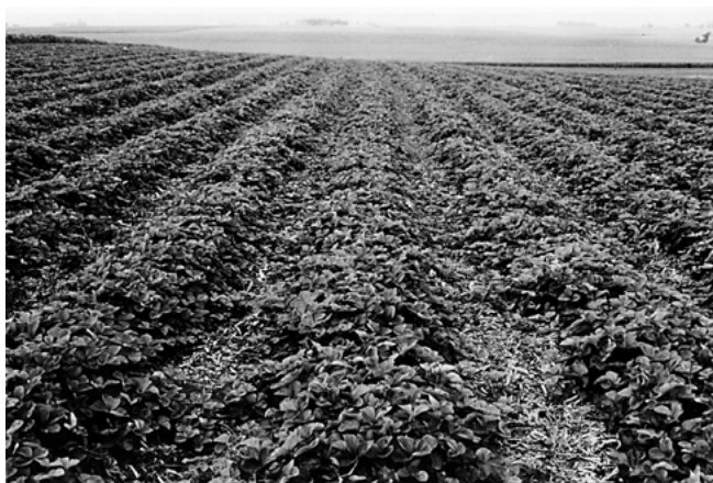
Figure 1. Matted-row strawberry production system common in eastern North America.

Strawberries are adapted to a variety of different soil types, provided they are well-drained. Plants usually bloom earlier on lighter soils and thus may increase needs for frost protection. Light or sandy soils are suitable for commercial production when irrigation is available and close attention is paid to nutritional (fertilizer) needs of the crop. Light soils are advantageous because they (1) warm up earlier in the spring than heavier soil types and allow production for the early market; (2) drain well, allowing field work and harvesting sooner after rain than heavier soils; and (3) have fewer root disease problems than heavy soils.