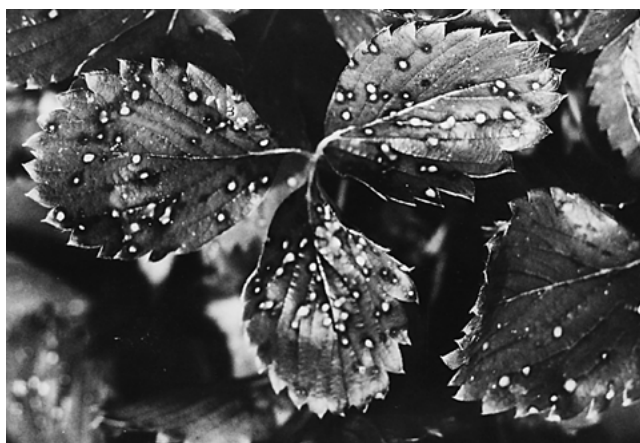
Figure 7. Leaf spot symptoms.

Use of varieties resistant to leaf scorch can reduce severity of outbreaks. Starting with disease-free plants and renewing strawberry plots frequently can also help prevent losses. Applying fungicides before the onset of fruiting may control the disease satisfactorily.