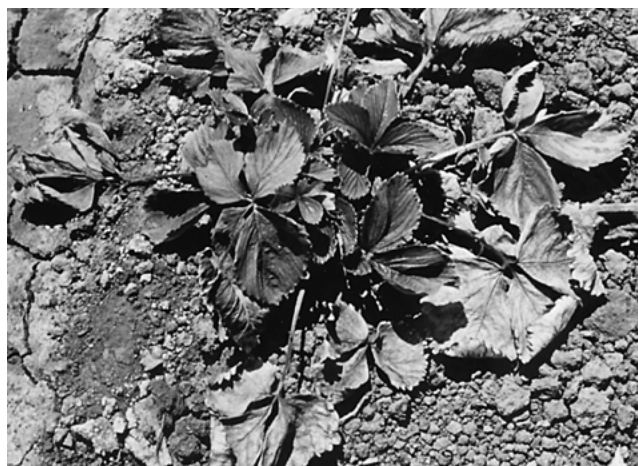
Figure 8. Verticillium wilt.

Measures such as improvement of soil aeration and/or planting on well-drained sites may help to reduce losses due to black root rot.