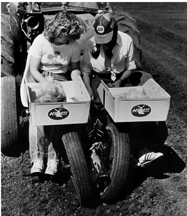
Figure 3. Use mechanical transplanters when large acreages must be planted.

Planting is best done as early in the spring as the ground can be worked. Plant either by hand or with a mechanical transplanter (figure 3) where a large acreage is to be planted. With either planting method, take care to see that plants are planted with the crown set neither too high nor too low. Planting too high exposes roots to the wind and plants die or are poor in performance (figure 4) while too deep planting may cause the crown to rot. Figure 5 illustrates too shallow of a planting depth.