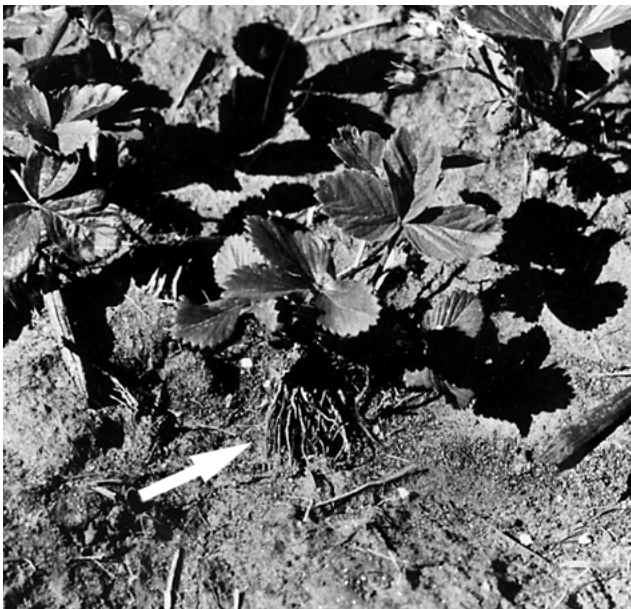
Figure 5. Strawberry plant planted too shallow exposing roots (arrow) to drying and resulting in poor establishment.

Base irrigation scheduling on plant requirements rather than on the calendar. Tensiometers, gypsum blocks, and data from pan evaporation are used in determining irrigation requirements. Generally, a planting should receive at least 1 inch of water per week during the growing season, either naturally from rainfall or through irrigation.