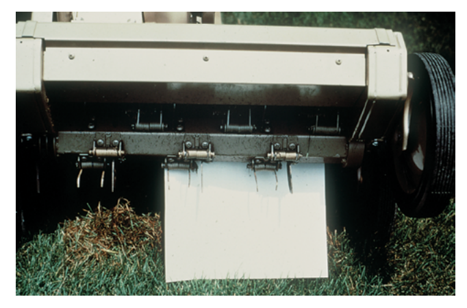
Figure 5. A spring-tined power rake can be used to remove about one quarter inch of thatch.

into the soil (Figure 5). Power raking does not have the added benefit of mixing soil and thatch.