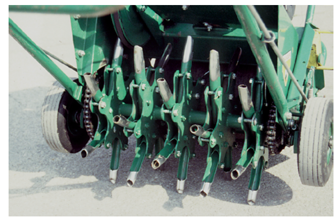
Figure 3. A core aerating machine removes soil plugs and spreads them on the lawn.