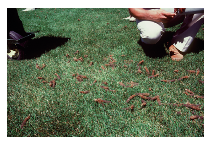
Figure 6. Soil cores from aerating machine are left on the surface to break down and provide a layer of topdressing.

Thatch development is a normal process in all lawns but can become a problem when the thatch layer is too thick. Thatch can be managed by moderating plant growth and encouraging microbial decay. Specialized equipment, such as vertical mowers and power rakes, can be rented to remove excess thatch.