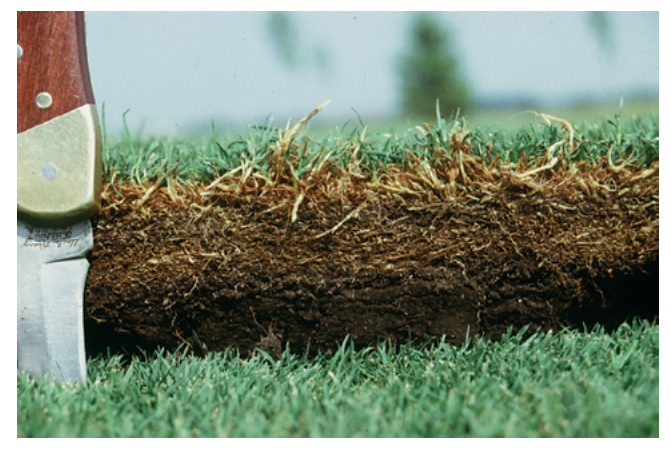
Figure 1. Thatch is a distinct layer of spongy brown organic matter consisting of living and dead roots, crowns, and lower shoots.

• Reduce nitrogen to slow plant growth and reduce biomass production. If using more than 4 pounds N/1,000 square feet/year then reduce yearly nitrogen rate. Some lawns on productive soils may only need 1 or 2 pounds N/1,000 square feet/year. Lawns receiving less nitrogen wilt less and require less frequent watering. Compost or an organic source of nitrogen should be alternated with inorganic sources of nitrogen in your annual lawn fertility program.