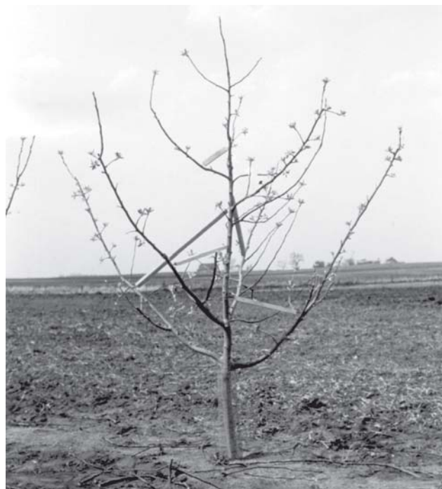
Fruit trees should be pruned and trained to develop a strong framework and improve light penetration through the tree.

As with excessive fertilizer applications, excessive pruning encourages vigorous shoot growth at the expense of flower bud formation. This is particularly true for young nonbearing trees. In order to encourage early fruiting on young trees, pruning should be kept to a minimum and be confined to developing a good framework.