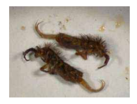
Figure 9: Close-up of springtails

Springtails are scavengers, feeding on decaying roots and fungi. They prefer to live in damp potting soil, especially a mix containing a high percentage of peat. Often associated with houseplants that are kept quite moist, they rarely, if ever, damage the plants. They're just annoying.