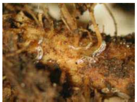
Figure 11: Fungus gnat larvae on poinsettia