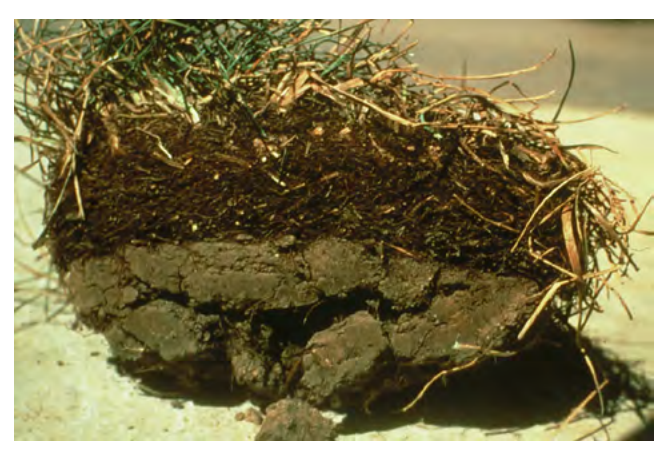
Figure 1. Thatch is a distinct layer of spongy brown organic matter consisting of living and dead roots, crowns, and lower shoots.

Like many systems in nature, a balance must be maintained. Lawns with less than a ½ inch of thatch seldom have thatch-related problems. When the rate of shoot production is equal to the rate of microbial decomposition, thatch is properly balanced and an excessive build up is avoided. There are two ways your lawn's thatch can be out of balance. First, plant material is produced too fast for a normal population of microbes to break it down. Second, the grass may be growing at a normal rate, but the microbes are not functioning properly. Biomass production can be influenced by controlling fertilizer and irrigation. Microbial populations are more responsive to uncontrollable environmental factors such as temperature and soil type.