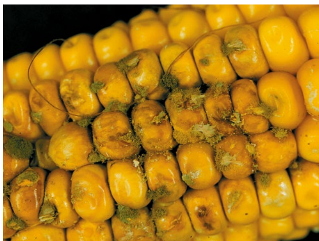
Figure 2. Aspergillus flavus spores on damaged corn kernels.