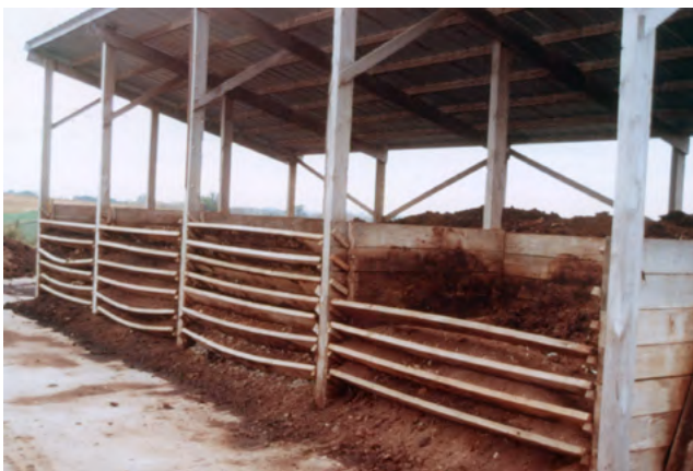
Figure 5. This simple four-bin swine mortality composting unit includes space for dry storage of cover material behind the bins.

Step 5: Estimate number of secondary bins: The number of secondary bins should equal the number of primary bins. In this case, 4 secondary bins are recommended.