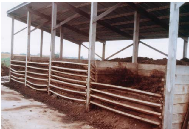
Figure 5. This simple four-bin swine mortality composting unity includes space for dry storage of cover material behind the bins.

Step 4: Estimate number of primary bins: To determine the number of primary bins needed, divide the estimated Total Primary Bin Volume (sum of values in column E of Table 1) by the Individual Bin Volume (step 3). If a fractional value is obtained, round UP to next whole number. For this example, dividing the total primary bin volume of 1610 cubic feet by the individual bin volume of 480 cubic feet yields a value of 3.35. Rounding this value UP, 4 primary bins are recommended.