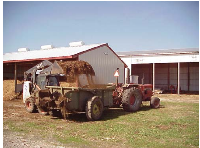
Figure 1. Composting rapidly decomposes swine mortalities, producing a soil-like product that can be spread on cropland.

Though sometimes used for emergencies, composting in open piles or windrows is not recommended for day-to-day mortality management. Open systems are vulnerable to saturation during wet weather, which can lead to