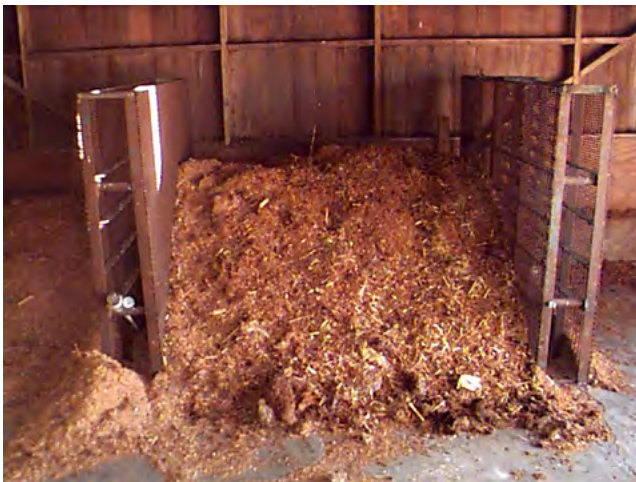
Figure 2. This low-cost bin composting system was constructed with used materials and is located inside a converted farm building.

Alternative cover materials that are much easier to obtain include chopped cornstalks or straw. Since these tend to be less absorptive and have poorer insulating properties than sawdust, their use requires more care during cold or wet weather. Poultry litter, a mixture of sawdust and poultry manure produced during turkey and broiler production, has been used successfully for carcass composting in the poultry industry. Not only does litter have the desirable characteristics of sawdust, the bacteria and nitrogen added by the manure make this mixture more biologically active than sawdust alone. Bedding from swine hoop buildings also can be used as cover material. Since the quality of used bedding from hoop buildings varies considerably, care should be taken to avoid materials that are saturated with liquid or that contain high proportions of manure because these conditions can lead to slow decay and/or excessive odor production.