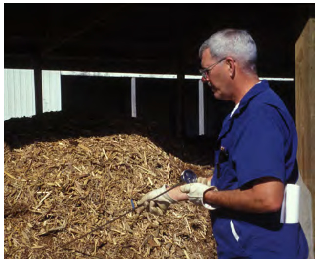
Figure 4. Checking internal temperatures with a composting thermometer is a quick way to determine if moisture and other conditions are suitable for rapid decay and pathogen reduction.

Bin-type composting systems located under a roof are recommended for best year-round performance, optimal processing, and minimal problems with runoff and scavengers. Total bin volume for a swine mortality composting operation is based on average daily weight of animals to be composted. Typically, about 20 cubic feet of primary bin volume is recommended for each pound of average daily loss, with an equal amount of secondary bin space.