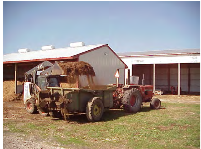
Figure 1. Composting rapidly decomposes swine mortalities, producing a soil-like product that can be spread on cropland.

Though sometimes used for emergencies, composting in open piles or windrows is not recommended for day-to-day mortality management. Open systems are vulnerable to saturation during wet weather, which can lead to odor production and release of contaminated leachate.