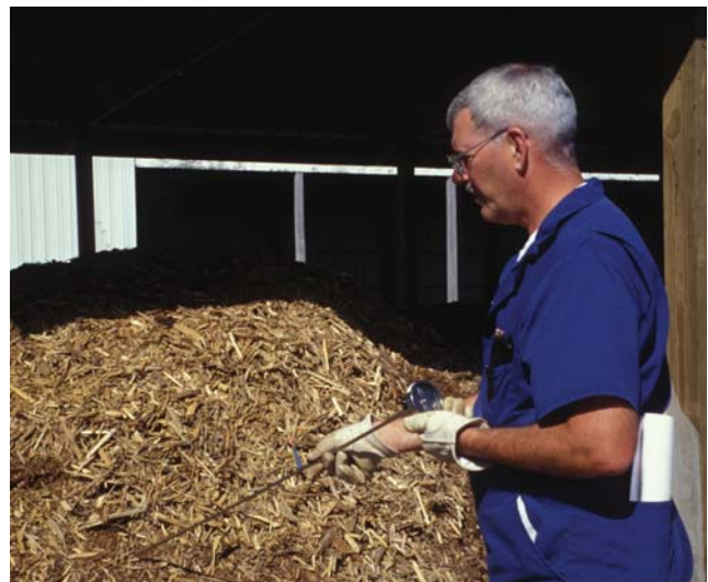
Figure 4. Checking internal temperatures with a composting thermometer is a quick way to determine if moisture and other conditions are suitable for rapid decay and pathogen reduction.

Bin-type composting systems located under a roof are recommended for best year-round performance, optimal processing, and minimal problems with runoff and scavengers. Total bin volume for a swine mortality composting operation is based on average daily weight of animals to be composted. Typically, about 20 cubic feet of primary bin volume is recommended for each pound of average daily loss, with an equal amount of secondary bin space.