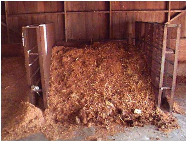
Figure 2. This low-cost bin composting system was constructed with used materials and is located inside a converted farm building.

Alternative cover materials that are much easier to obtain include chopped cornstalks or straw. Since these tend to be less absorptive and have poorer insulating properties than sawdust, their use requires more care during cold or wet weather. Poultry litter, a mixture of sawdust and poultry manure produced during turkey and broiler production, has been used successfully for carcass composting in the poultry industry. Not only does litter have the desirable characteristics of sawdust, the bacteria and nitrogen added by the manure make this mixture more biologically active than sawdust alone. Bedding from swine hoop buildings also can be used as cover material. Since the quality of used bedding from hoop buildings varies considerably, care should be taken to avoid materials that are saturated with liquid or that contain high proportions of manure because these conditions can lead to slow decay and/or excessive odor production.