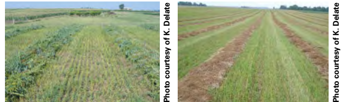
The best method for harvesting organic flax is to windrow the flax first with a swather, then use a pick-up combine after weeds have dried down from green (left) to brown (right) and the moisture in the flax in the windrows has decreased to at least 10 percent.

While flax does not shatter or lodge as easily as other small grains, follow additional harvest considerations in order to obtain the highest quality organic flax. Because herbicides cannot be used, and excessive green weeds in organic fields at harvest can interfere with combining, flax usually is windrowed and allowed to dry before combining. Combining without windrowing is only recommended for weed-free fields.