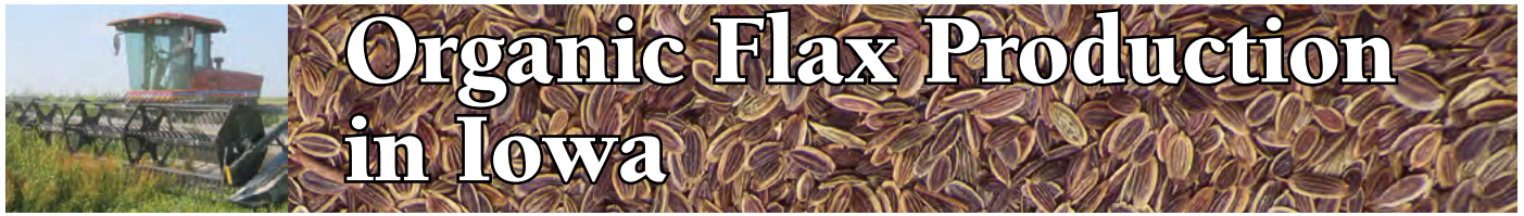
Windrower/swather used to harvest flax.