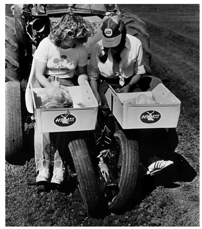
Figure 3. Use mechanical transplanters when large acreages must be planted.

Planting is best done as early in the spring as the ground can be worked. Plant either by hand or with a mechanical transplanter (figure 3) where a large acreage is to be planted. With either planting method, take care to see that plants are planted with the crown set neither too high nor too low. Planting too high exposes roots to the wind and plants die or are poor in performance (figure 4) while too deep planting may cause the crown to rot. Figure 5 illustrates too shallow of a planting depth.