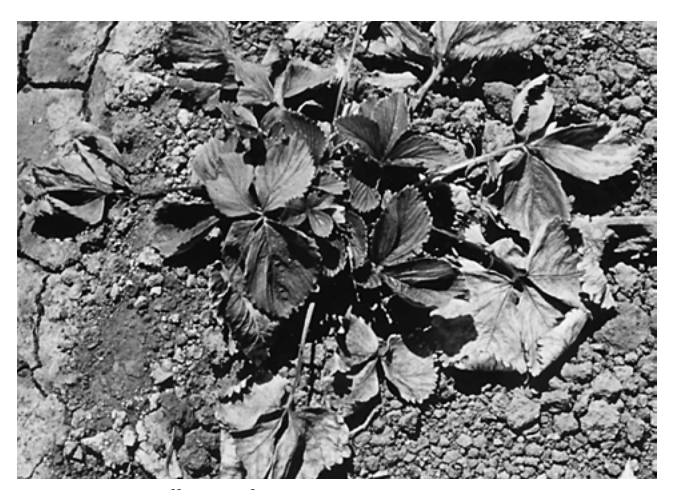
Figure 8. Verticillium wilt.

Measures such as improvement of soil aeration and/or planting on well-drained sites may help to reduce losses due to black root rot.