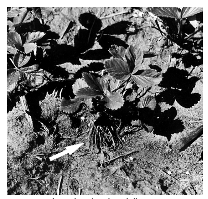
Figure 5. Strawberry plant planted too shallow exposing roots (arrow) to drying and resulting in poor establishment.

Base irrigation scheduling on plant requirements rather than on the calendar. Tensiometers, gypsum blocks, and data from pan evaporation are used in determining irrigation requirements. Generally, a planting should receive at least 1 inch of water per week during the growing season, either naturally from rainfall or through irrigation.