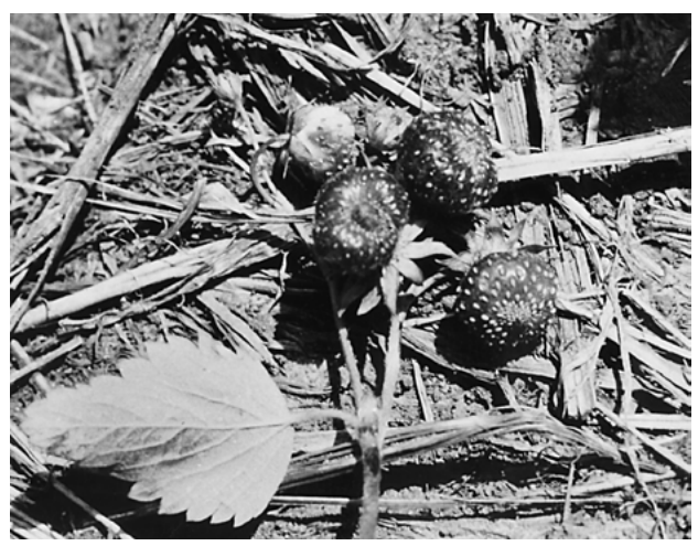
Figure 9. Button berries that result from the feeding of the tarnished plant bug.

Several types of diseases can cause strawberry fruit rots. Information on the most common fruit rot diseases is in table 1 on page 9.