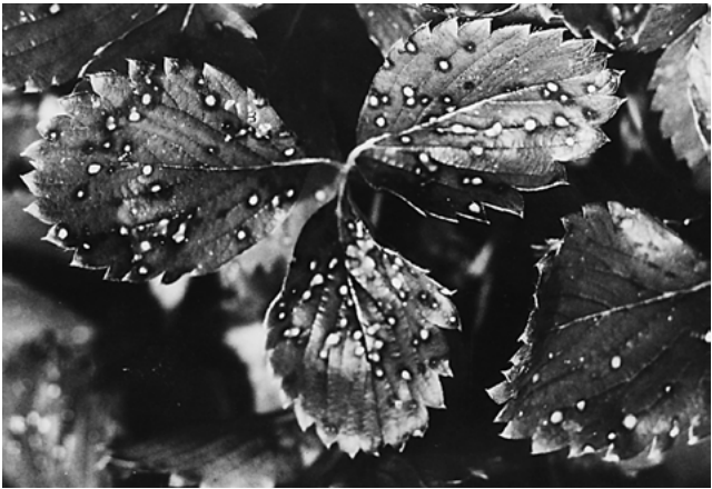
Figure 7. Leaf spot symptoms.

Use of varieties resistant to leaf scorch can reduce severity of outbreaks. Starting with disease-free plants and renewing strawberry plots frequently can also help prevent losses. Applying fungicides before the onset of fruiting may control the disease satisfactorily.