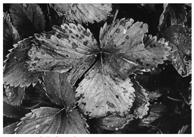
Figure 6. Early leaf scorch symptoms.

Because the powdery mildew fungus apparently survives the winter on living leaves, removing leaves that appear infected before flowering begins may help reduce disease severity. Many widely available commercial cultivars are highly resistant to powdery mildew. Applying fungicides at regular intervals from the early flower period through the growing season also can control the disease and limits its carryover from one growing season to the next. However, use of fungicides to control powdery mildew on the foliage has not significantly increased yields, even for highly susceptible cultivars.