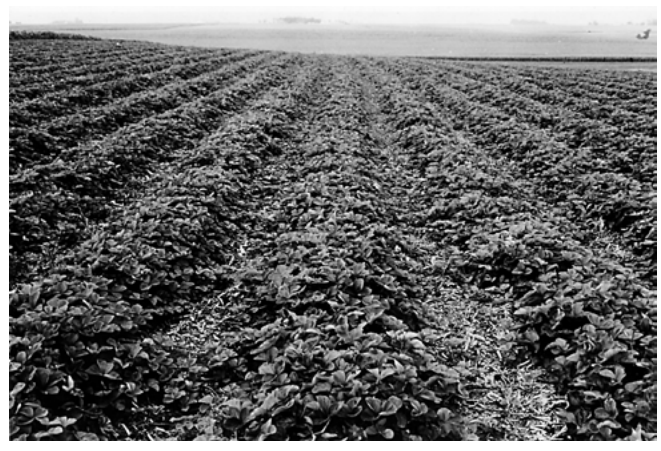
Figure 1. Matted-row strawberry production system common in eastern North America.

Strawberries are adapted to a variety of different soil types, provided they are well-drained. Plants usually bloom earlier on lighter soils and thus may increase needs for frost protection. Light or sandy soils are suitable for commercial production when irrigation is available and close attention is paid to nutritional (fertilizer) needs of the crop. Light soils are advantageous because they (1) warm up earlier in the spring than heavier soil types and allow production for the early market; (2) drain well, allowing field work and harvesting sooner after rain than heavier soils; and (3) have fewer root disease problems than heavy soils.