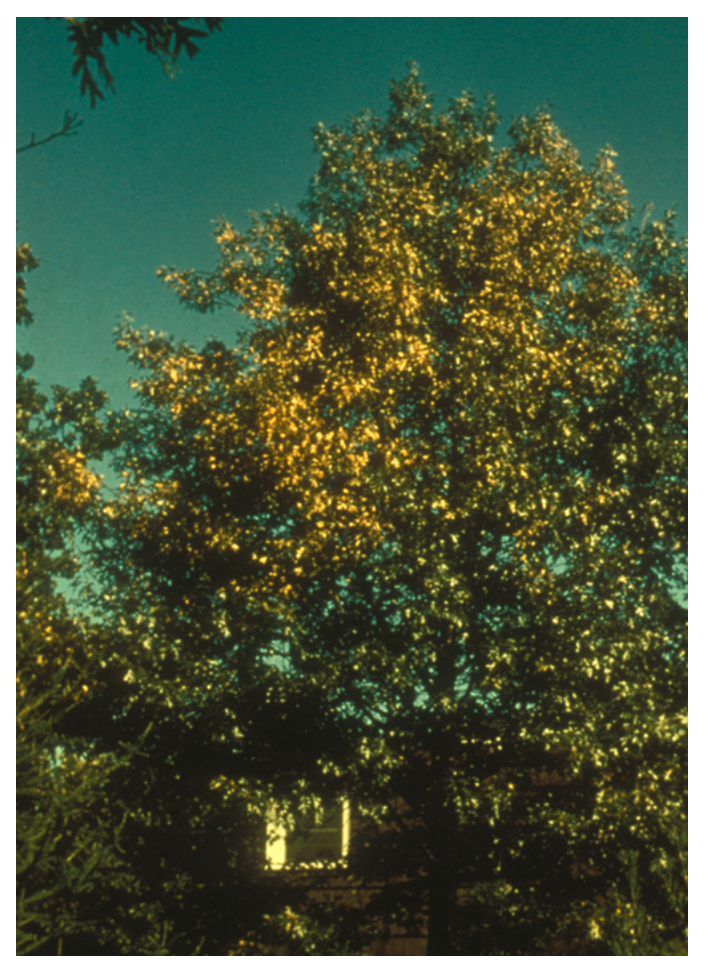
Figure 4. A wilting white oak.