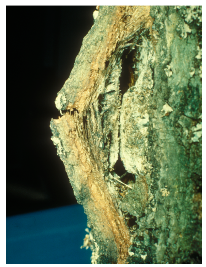
Figure 10. Side view of an infection cushion of the oak wilt fungus under the bark of a red oak.

Oak wilt also is spread by spores produced on infected trees. As trees of the red oak group begin to die, usually within several months after infection, the fungus begins to grow abundantly between the bark and the sapwood of the trunk or a branch. Patches of fungal filaments, called mycelial mats, push outward on the bark as they grow, eventually opening longitudinal cracks in the bark (Figures 10 and 11). Mycelial mats develop primarily during spring and fall months, and less often during the summer. The mats release a fruity odor that attracts sap-feeding insects, particularly picnic beetles of the Nitidulidae family (Figure 12). Sticky spores of the fungus, which develop on the mycelial mats, become attached to the beetles. The beetles then may fly to other oak trees and feed on the sap flow from fresh wounds,