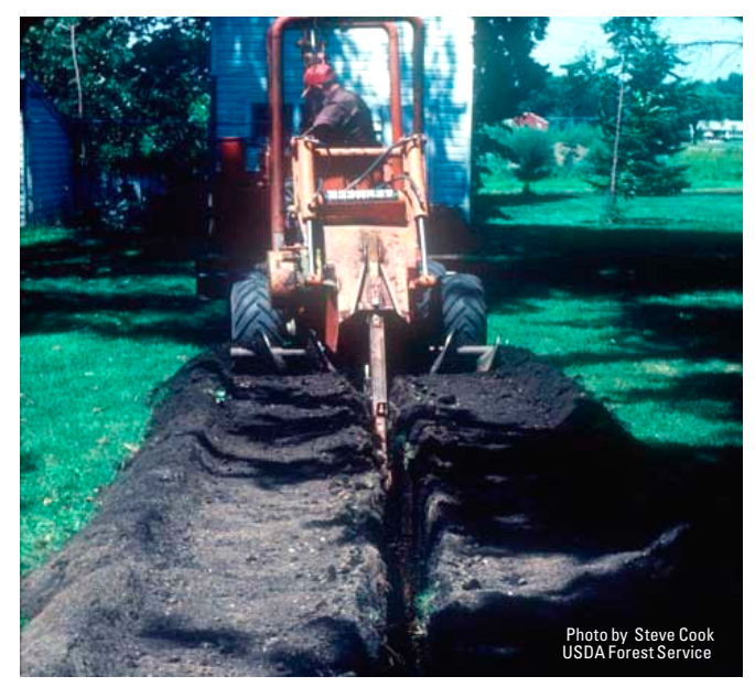
Figure 14. A trenching machine can be used to break root grafts between adjacent oaks of the same species.

In situations where root grafts cannot be broken mechanically due to the presence of barriers such as sidewalks, driveways, and buried utility lines, a soil fumigant can be used to kill the grafted roots. The fumigant is placed in the soil between adjacent diseased and healthy trees. The fumigant most commonly used for this purpose is sodium-n-methyl dithiocarbamate