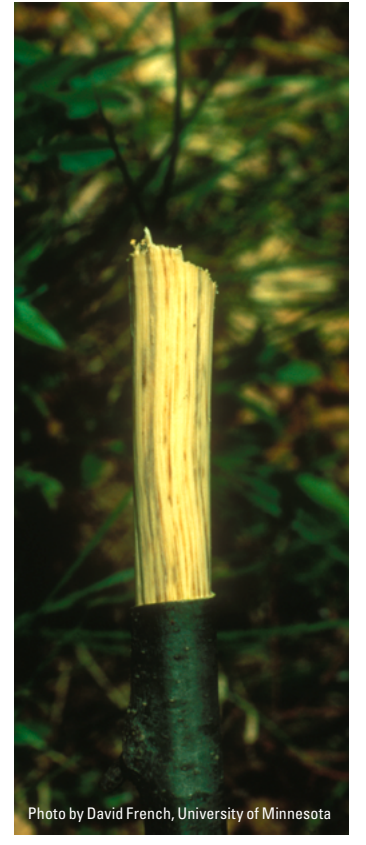
Figure 3. Brown streaks in the sapwood of a red oak branch.