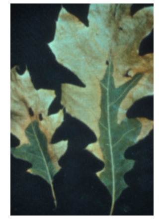
Figure 2. Browning of the margins of red oak leaves.