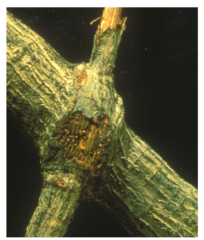
Figure 8. Root graft joining roots from adjacent oak trees of the same species.

Roots of oaks form natural grafts with roots of adjacent oaks of the same species up to 50 feet apart (Figure 8). Root grafts link together the vascular systems of the trees, forming a common network through which the oak wilt fungus can move. Root grafts rarely occur between oaks of different species. The oak wilt fungus