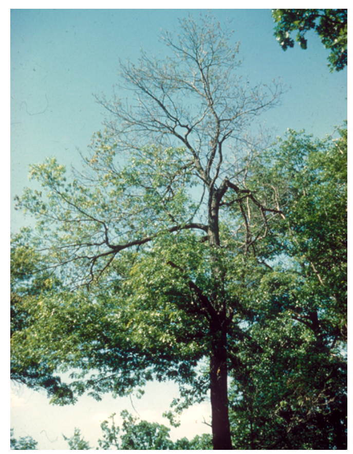
Figure 1. A red oak dying from oak wilt.

Symptoms are more variable in the white oak group than in the red oak group. Although symptoms may develop in a sequence similar to that of the red oak group, they often begin in mid- to late summer and progress more slowly in the white oak group. In a given year, only a few branches of an infected tree, scattered through the crown, may show symptoms and die back (Figure 4). Leaf browning in the white oak group (Figure 5) occurs in a pattern similar to that in the red oak group (Figure 2). Trees infected for two or more years commonly develop isolated dead branches in the crown. Brown streaks often are found in the sapwood of infected branches. In white oaks, discoloration of the xylem often shows as a dark ring when the branch is cut in crosssection (Figure 6).