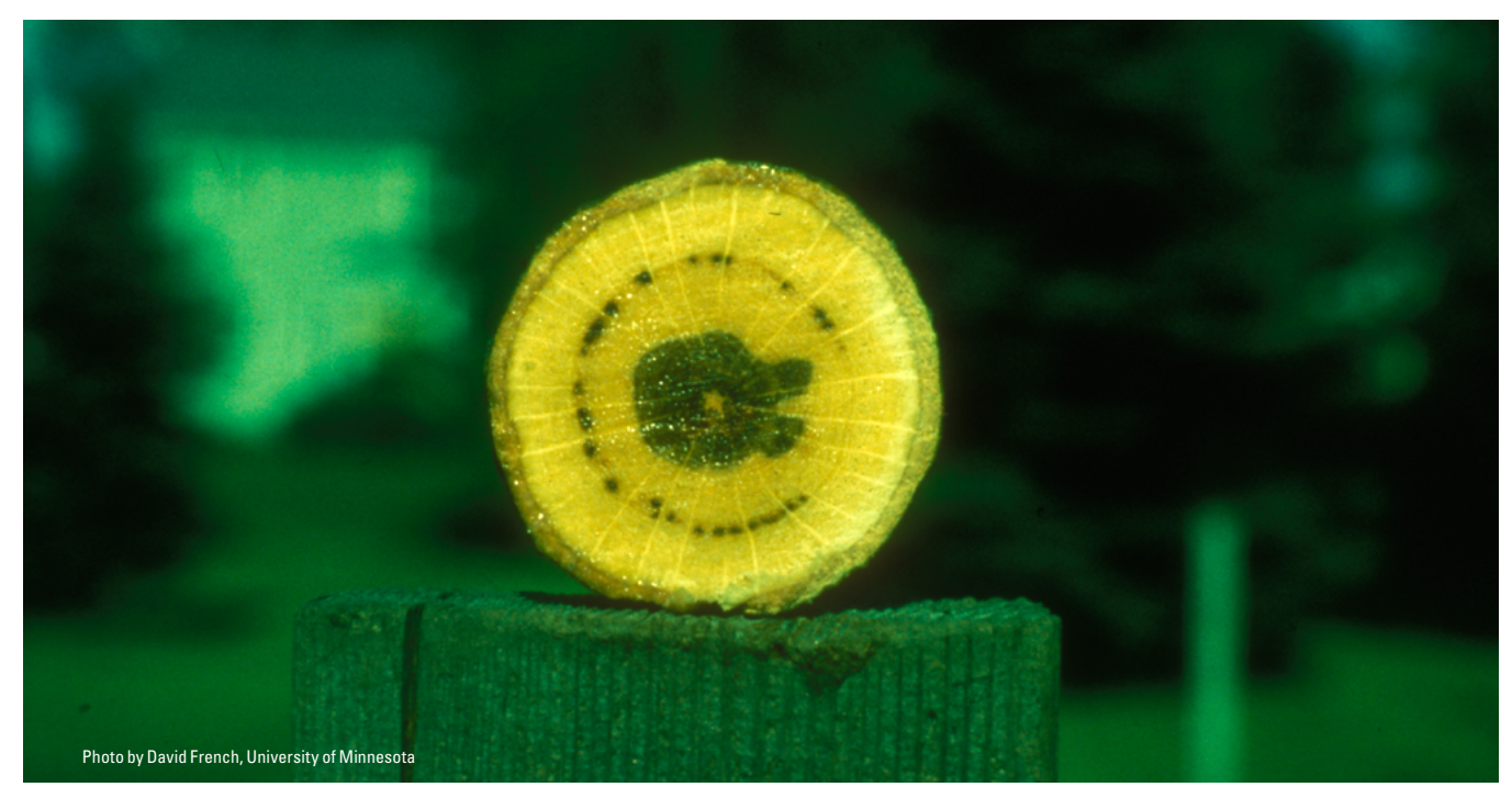
Figure 6. Browning of the vascular system of a white oak.