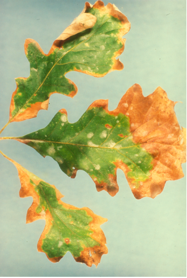
Figure 5. Marginal browning of white oak (bur) leaves.