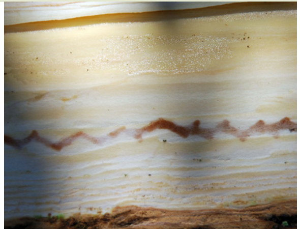
Ash Cambium Miner

Exit holes are not evident on outer bark.