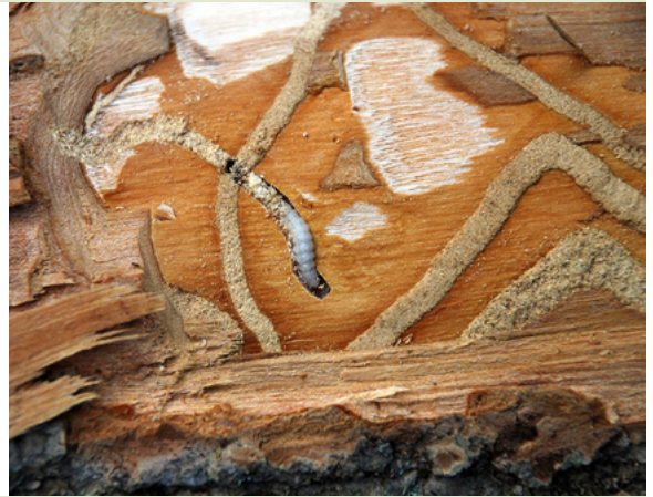
Redheaded Ash Borer tunnels (and prepupa)

Round exit holes are evident on the outer bark.