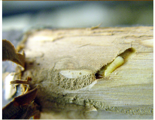
Redheaded Ash Borer