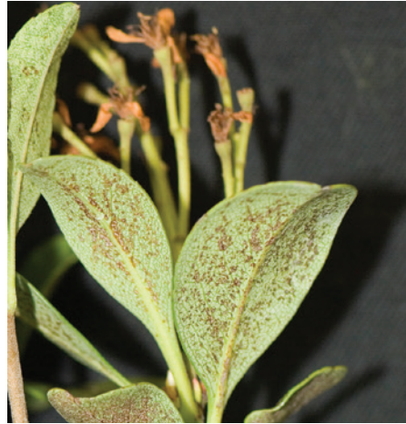
Indian hawthorne landscape damage.

Plants with the symptoms described above should be examined for the presence of thrips. Leaves or buds from symptomatic plants should be collected and placed into a Ziploc bag to prevent the thrips from escaping. Label the bag with collection locality information, host plant, date collected and name of collector. Samples should be sent next-day delivery to an expert for identification