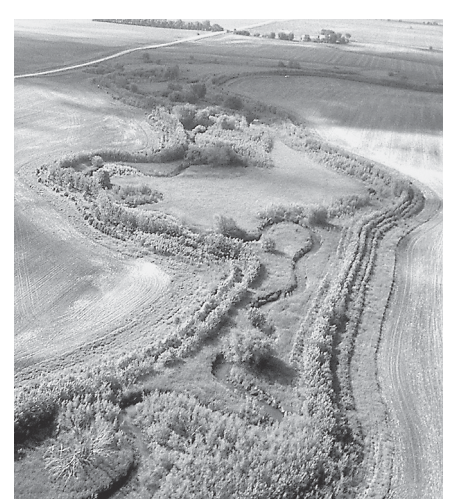
A well designed riparian management system enhances land function and aesthetics.

• Will I need money after the contract period has expired? To help you better communicate with the natural resource professional, the next brochure in this series outlines specific