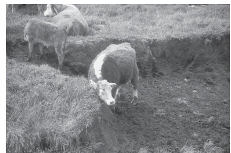
Concerns with present stream condition: Erosion and loss of cropground, tile drainage into the stream, and erosion by livestock.