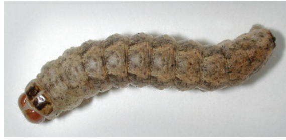
Western bean cutworms can be identified by the two broad, brown stripes on the pronotum.

A nominal threshold is 8 percent of the plants with eggs or young larvae found on the flag leaf or in the tassel during the silking/blister/early milk-stage corn stages (R1-early R3).