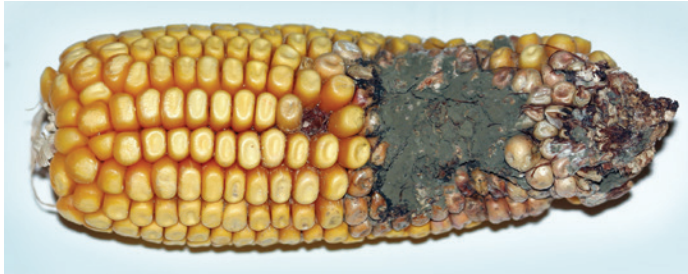
Mold often develops on corn kernels damaged by western bean cutworms.

Larvae chew through the husk or the silks to reach the kernels. Unlike corn earworms, which restrict most of their feeding to the ear tip, western bean cutworms may feed anywhere on the ear.