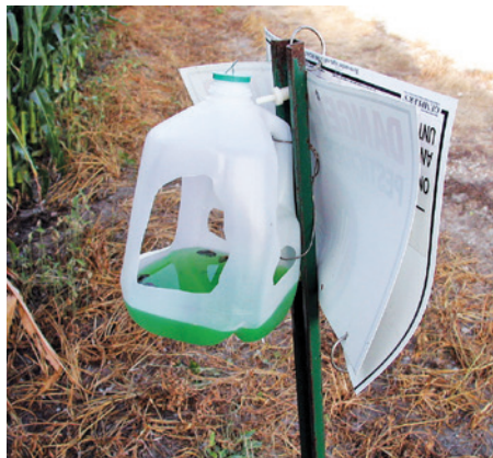
Pheromone trap made from a milk jug.

Inspect the upper 3–4 leaves on 20 consecutive plants at five locations. Scout hybrids in different stages of development separately.