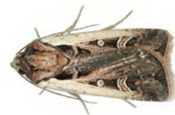
Western bean cutworm adult.

Newly-hatched larvae are a dull orange color with black heads, a black pronotum (hardened plate immediately behind the head) and 8-10 black spots on each body segment. Mature larvae have a broad, faint tan stripe along the back, no distinctive spots, an orange head, and the pronotum has two broad brown stripes, which are good characteristics to distinguish it from other corn caterpillars. Mature larvae are 1½ inches long. There are 6, and occasionally 7, larval stages. Larvae require about 56 days to develop.