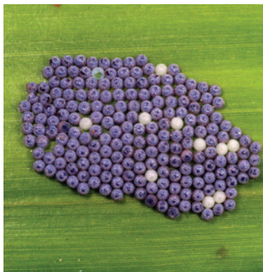
Western bean cutworm eggs (left, newly laid; right, ready to hatch).

Newly-hatched larvae are a dull orange color with black heads, a black pronotum (hardened plate immediately behind the head) and 8-10 black spots on each body segment. Mature larvae have a broad, faint tan stripe along the back, no distinctive spots, an orange head, and the pronotum has two broad brown stripes, which are good characteristics to distinguish it from other corn caterpillars. Mature larvae are 1½ inches long. There are 6, and occasionally 7, larval stages. Larvae require about 56 days to develop.