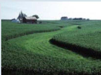
Figure 2. Grassed waterway.