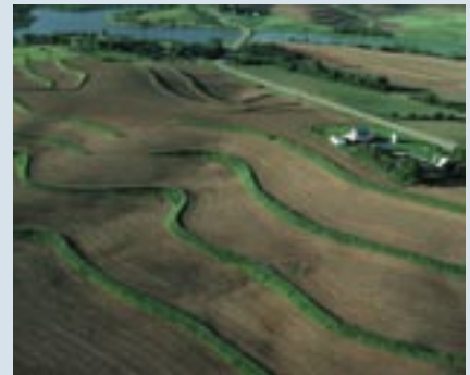
Figure 3. Contour terraces.