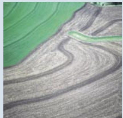
Figure 5. Contour farming.