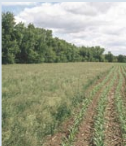
Figure 4. Conservation buffers.