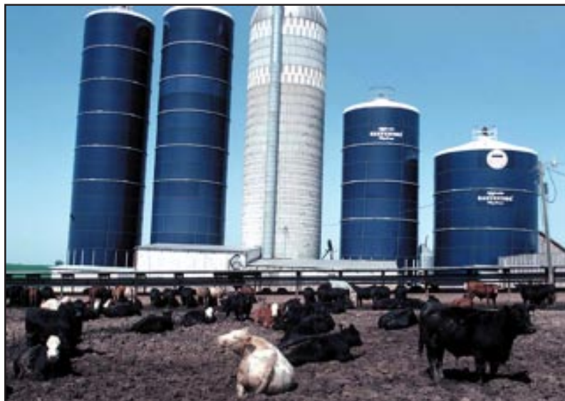
A cattlefeedlot in Iowa.

Iowa is a state with many farmer/feeders. Manure from feedlot cattle is a valuable source of fertilizer nutrients. However, as agriculture, as a whole, continues to move toward becoming a more environmentally aware industry, management of excreted nutrients will receive more attention in feedlot operations. Producers will need to be more aware of nutrient production and nutrient use within their own operation and how best to maintain a balance between the two.