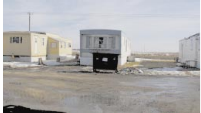
Lack of low cost housing is a frequent barrier to immigration

A common stereotype is that many immigrant cultures prefer to live in crowded quarters. The reality is no one likes to live in crowded conditions. People may be forced to live eight or ten to a living unit; however, that usually happens because of necessity rather than choice.