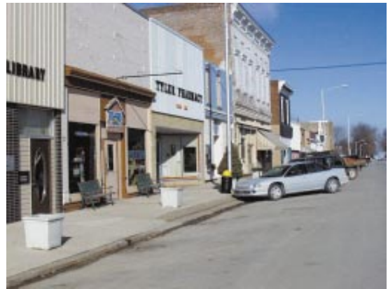
Lenox business district

Perry (population 7,633) historically was a railroad town. The railroads were major employers that fueled the local economy. The railroad jobs had left town by 1980 and Perry went into an economic decline. The population has increased since about 1990 when Hispanics first began moving into Perry to work at a meat packing company. According to one estimate, 40 percent of the population is now Hispanic.