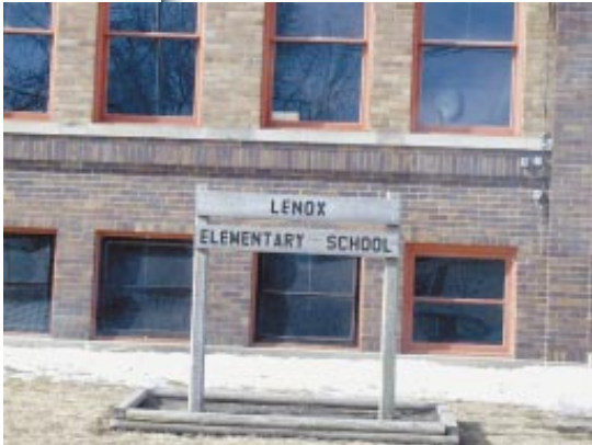
Lenox Elementary School

aides are helpful and necessary in most cases. Middle and high school students generally require more resources. Examples include bilingual teacher aides and native language textbooks to supplement English language textbooks.