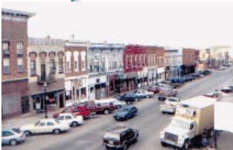
Downtown Columbus Junction

Columbus Junction (population 1,900) has had a small population of Spanish-speaking residents for many years. When IBP, a hog “harvesting” facility, expanded the size of its hog slaughtering plant at the edge of town in about 1990, the Spanish-speaking workforce quickly swelled. Housing was immediately a major problem. Upstairs retail buildings in the downtown were converted into “dormitory” style housing. People slept in their cars because there was little affordable housing. The city tried without much success to attract developers who would build rental-housing units.