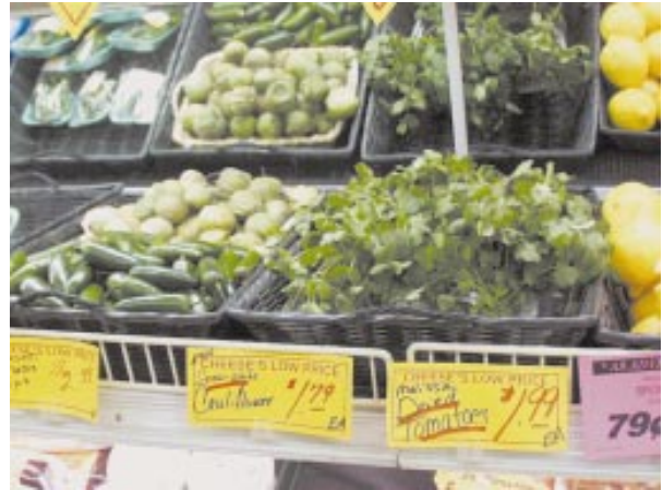
Ethnic food in a grocery store

There appears to be a slight undertone of resentment in the Anglo community when an Anglo business owner advertises to attract immigrant customers. It doesn't appear to be a significant factor, but some established customers may temporarily boycott a business actively seeking immigrant customers. "It makes me uncomfortable when several Hispanics are in the store," one customer was quoted as saying.