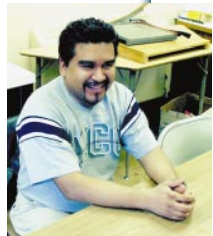
Translators and bilingual staff are needed

By default, children of immigrants often serve as interpreters. Children go to the bank with their non-English speaking parents to translate. Children often are used in schools to translate for teachers, parents, and other students. This can lead to conflicts. Educators have learned not to allow children to translate at parent-teacher conferences.