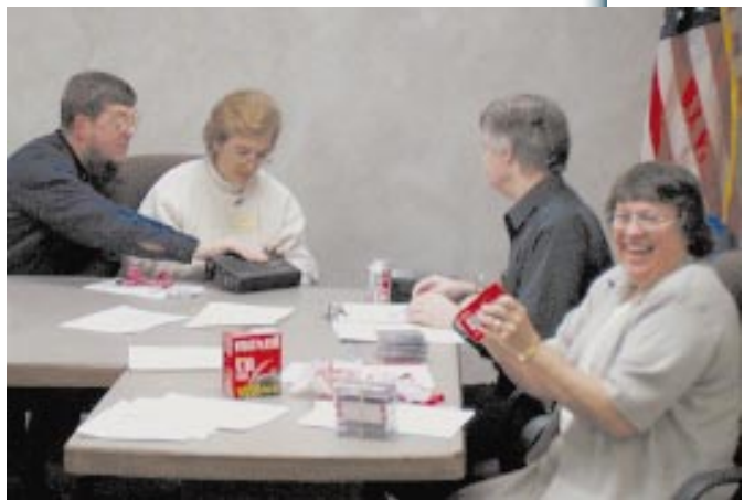
Members of the interview team

To find answers to these questions, the Keokuk County Extension Office of Iowa State University wrote and received a Value-Added Ag Field Project Grant. The purpose of the grant was to research how other communities in Iowa have dealt with an influx of foreign workers. The objective was to learn from the experiences of other communities and to provide practical educational programs for communities beginning to experience in-migration of culturally diverse workers.