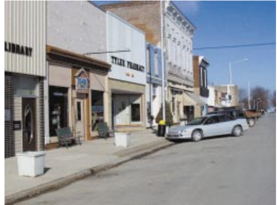
Lenox business district

Perry (population 7,633) historically was a railroad town. The railroads were major employers that fueled the local economy. The railroad jobs had left town by 1980 and Perry went into an economic decline. The population has increased since about 1990 when Hispanics first began moving into Perry to work at a meat packing company. According to one estimate, 40 percent of the population is now Hispanic.