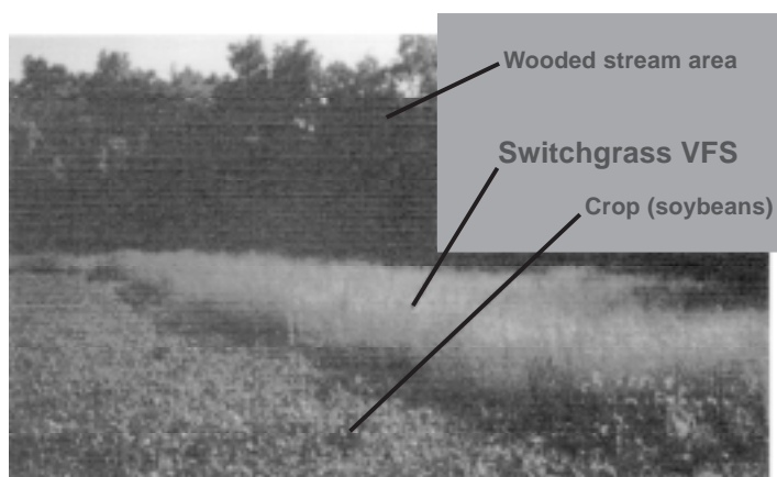
A three-year-old 66-foot wide filter strip bordering a small stream in Boone County, Iowa.

Total nitrogen (N) and phosphorus (P) removal is closely related to sediment removal. In a Virginia experiment, vegetative filter strips 15 feet wide removed 55 percent of the N and 60 percent of the P from runoff water. Even so, there was enough dissolved N and P in the water that did pass through the strips to support algae and plant growth in streams or lakes. Other researchers have reported similar removals of P, but lower rates of N removal. Nitrogen and phosphorus that are dissolved in runoff water that reaches the VFS are